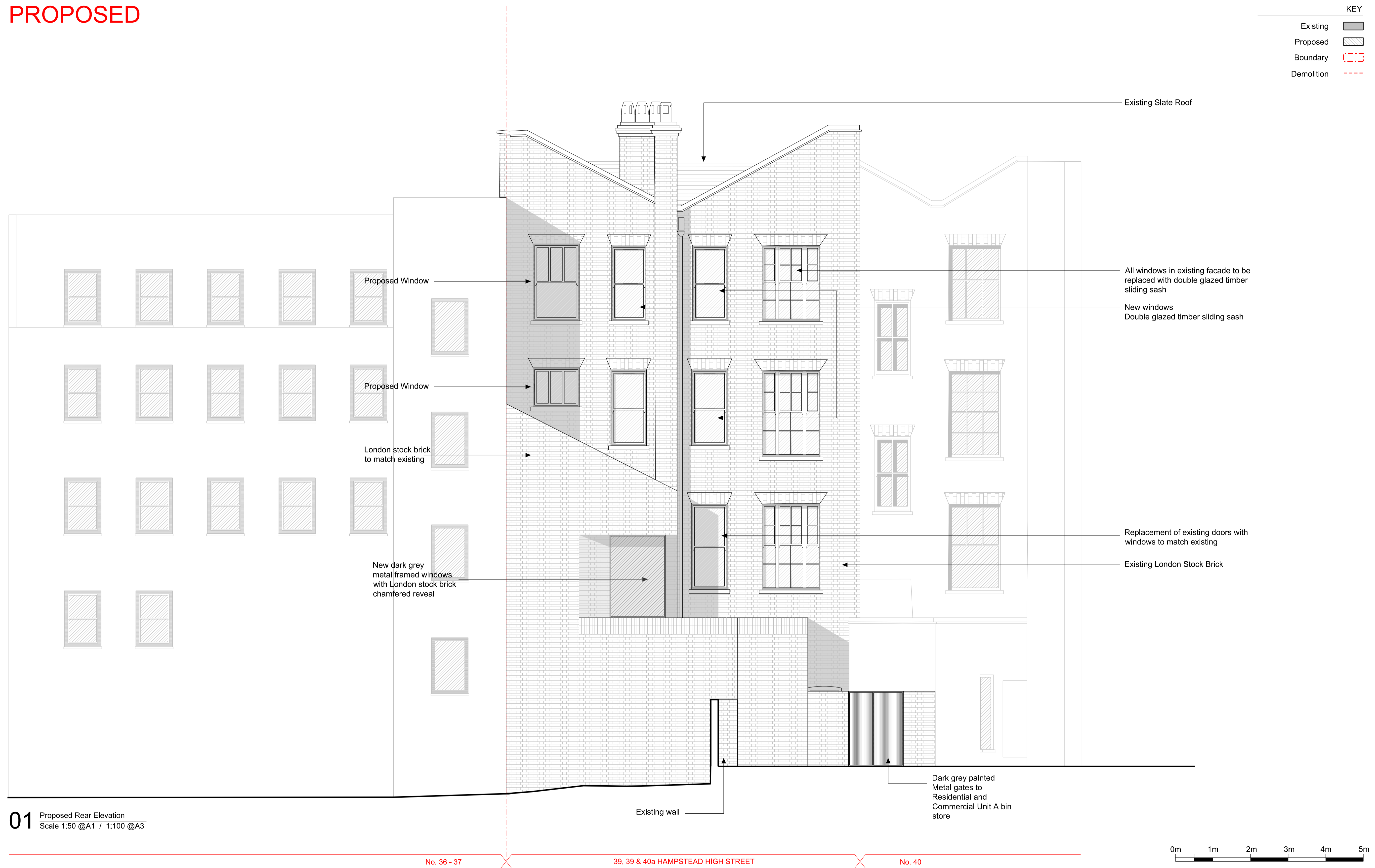
01 Proposed Rear Elevation Scale 1:50 @A1 / 1:100 @A3

PATALAB 15 Garrett Street London EC1Y 0TY p: +44 (0)20 7253 2036 w: www.patalab.com e: info@patalab.com