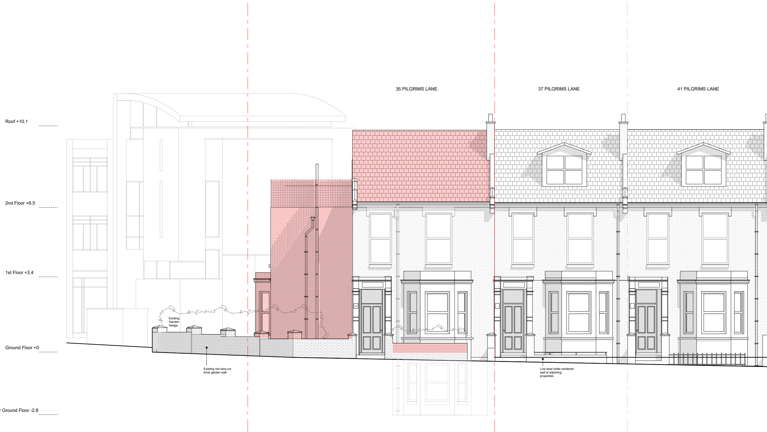
EXISTING FRONT ELEVATION SCALE 1:100 @A3