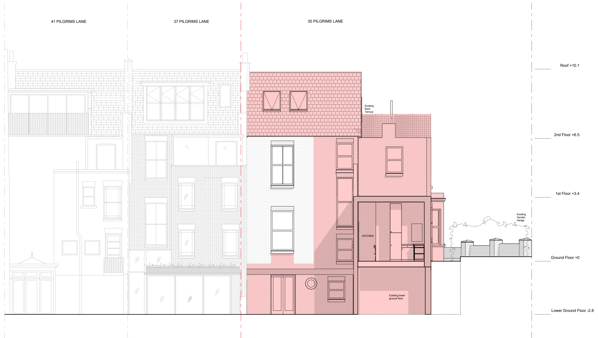
EXISTING REAR ELEVATION SCALE 1:100 @A3