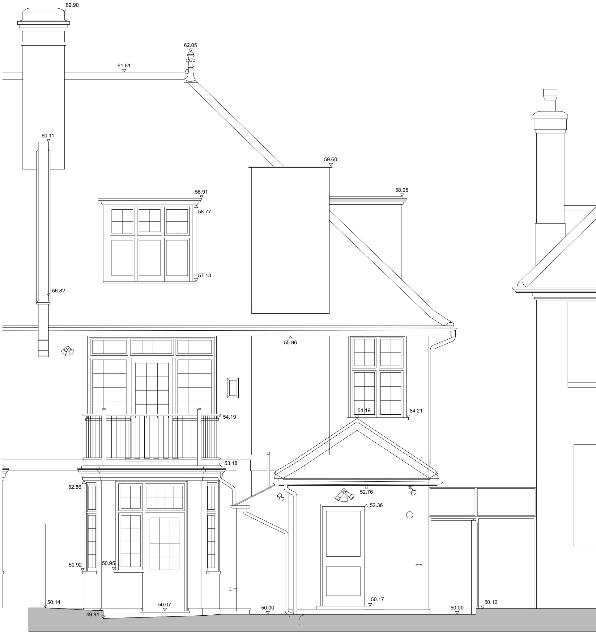
1 Existing Elevation 3 1:50