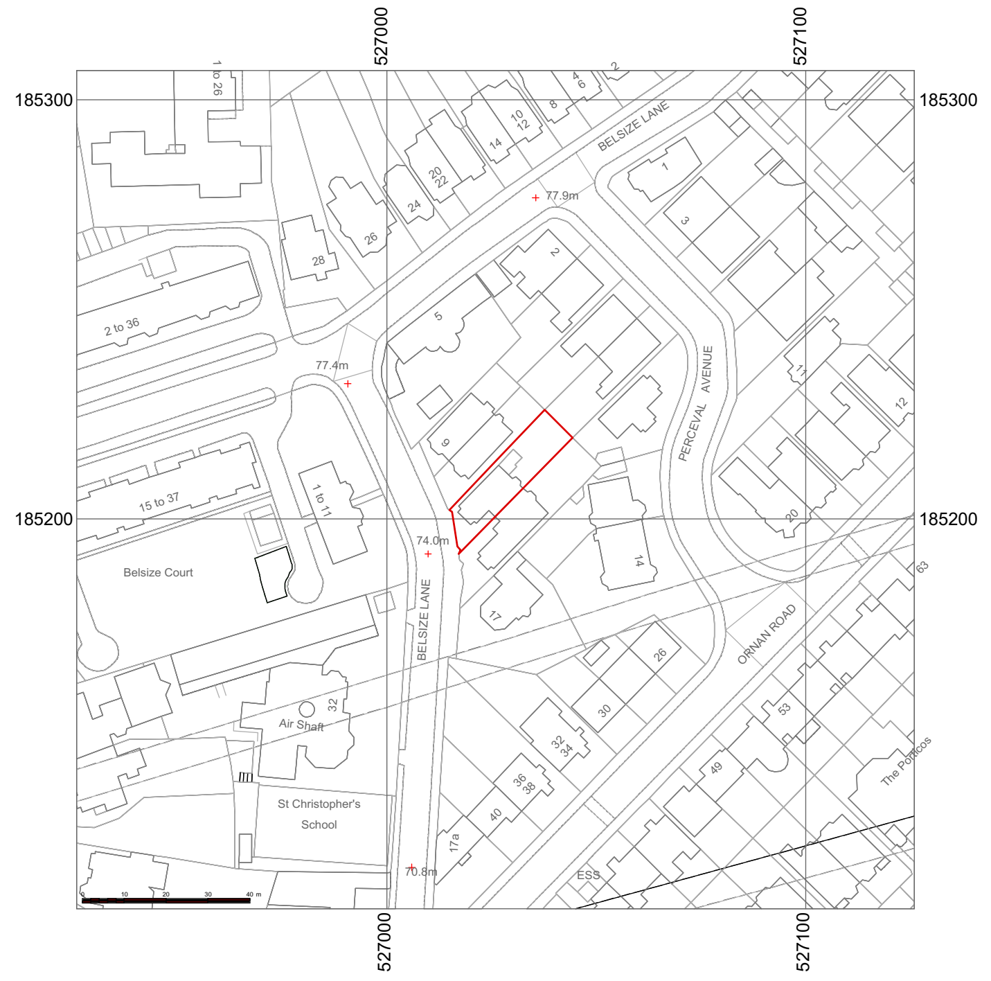
1 Location Plan 1:1250