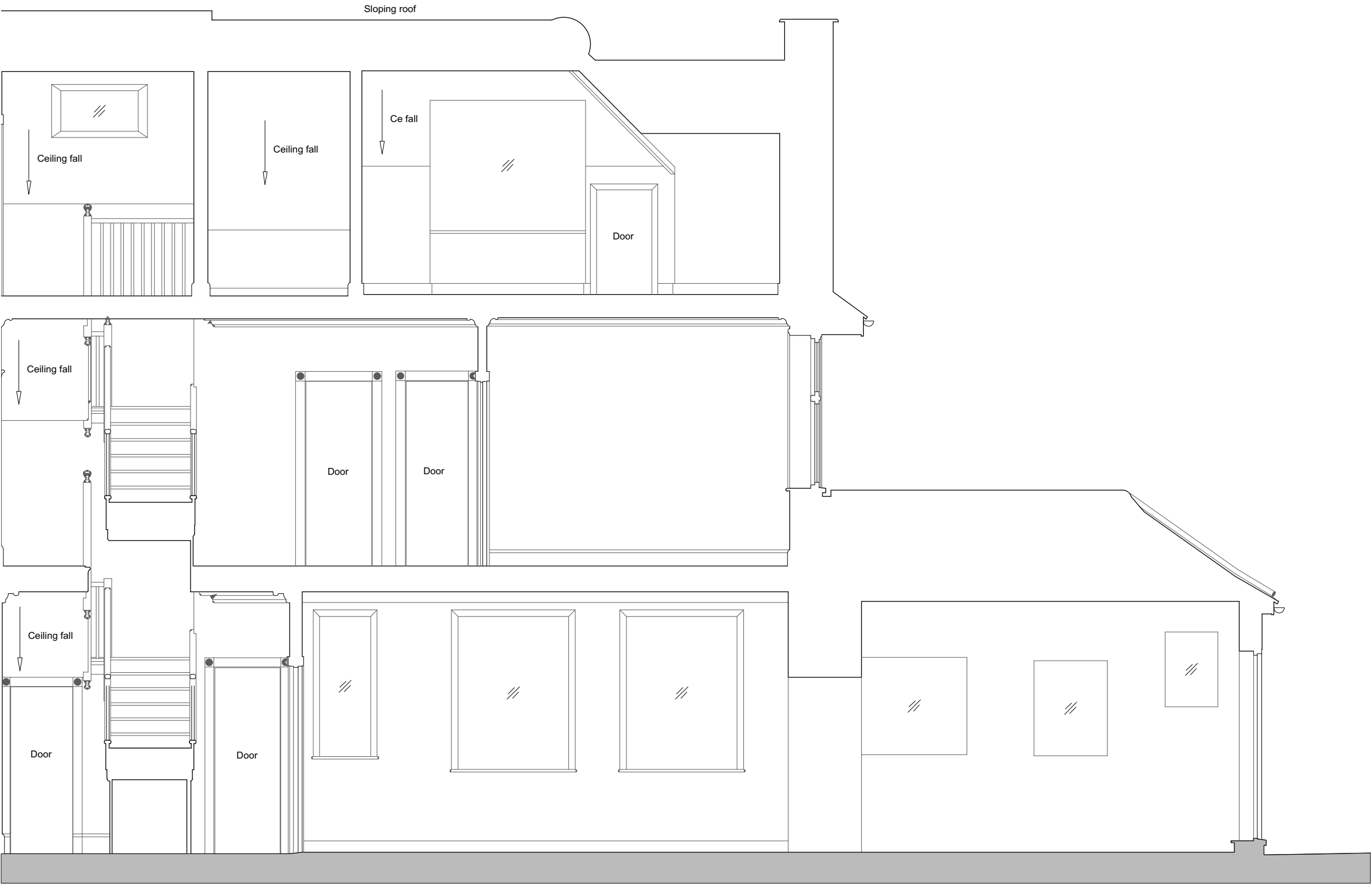
1 Existing Section AA 1:50