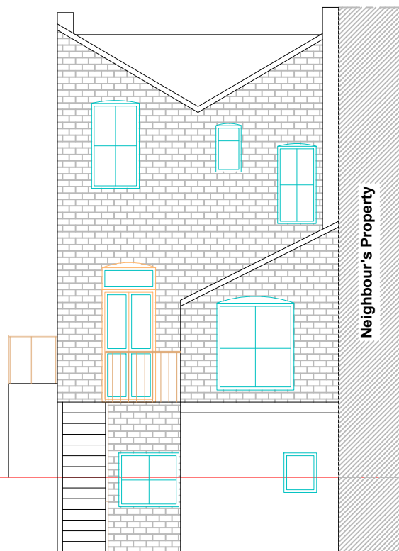
5 EXISTING REAR ELEVATION SCALE 1:100 @ A3