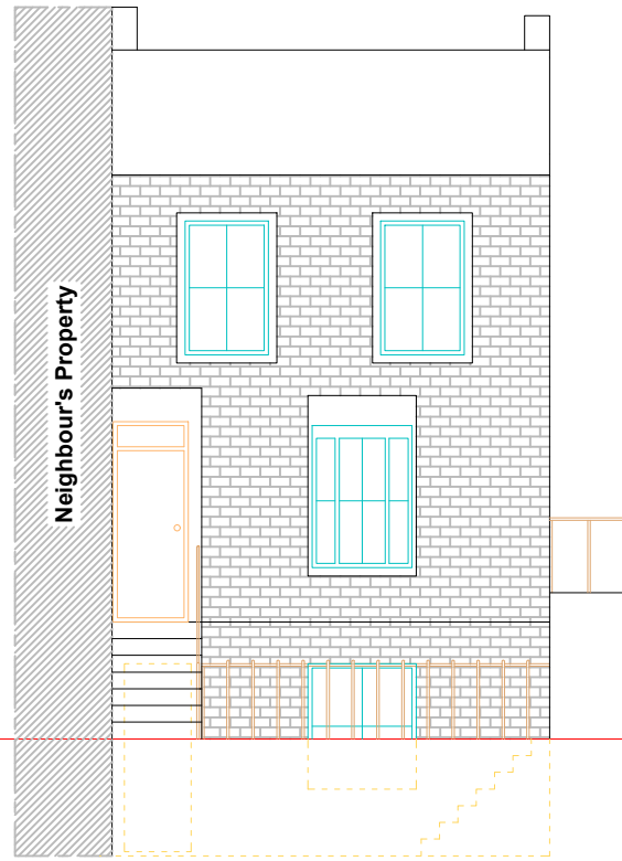
3 EXISTING FRONT ELEVATION SCALE 1:100 @ A3

General Notes: All dimensions are in millimeters unless noted otherwise. All dimensions to be verified on site. Do not scale from the drawings. For any discrepancies and omissions, it is recipient's responsibility to verify the same specifically with the designer. The copyright of this drawing is held by Crystal Extension Architecture. No unauthorized use or copies are permitted without our consent.