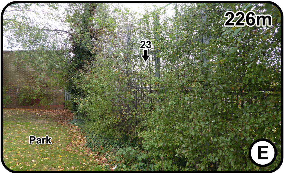
View from Maygrove Peace Park from 226m