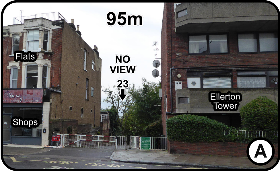
Gap beside Ellerton Tower on Mill Lane.

23 Ravenshaw Street London NW6 1NP 2017/0911/P