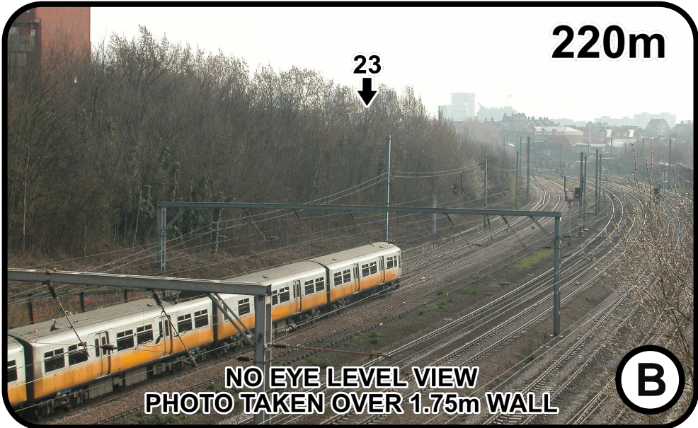
View over the 1.75m Mill Lane Railway Bridge Wall