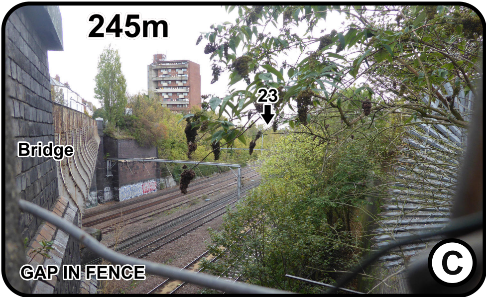
View through a gap in the fence at Mill Lane Bridge