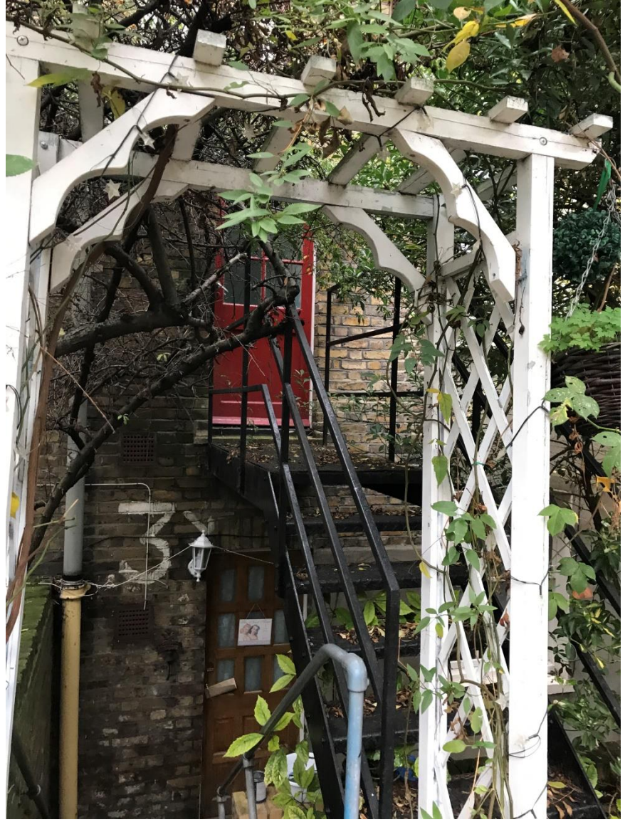
General Rear Elevation