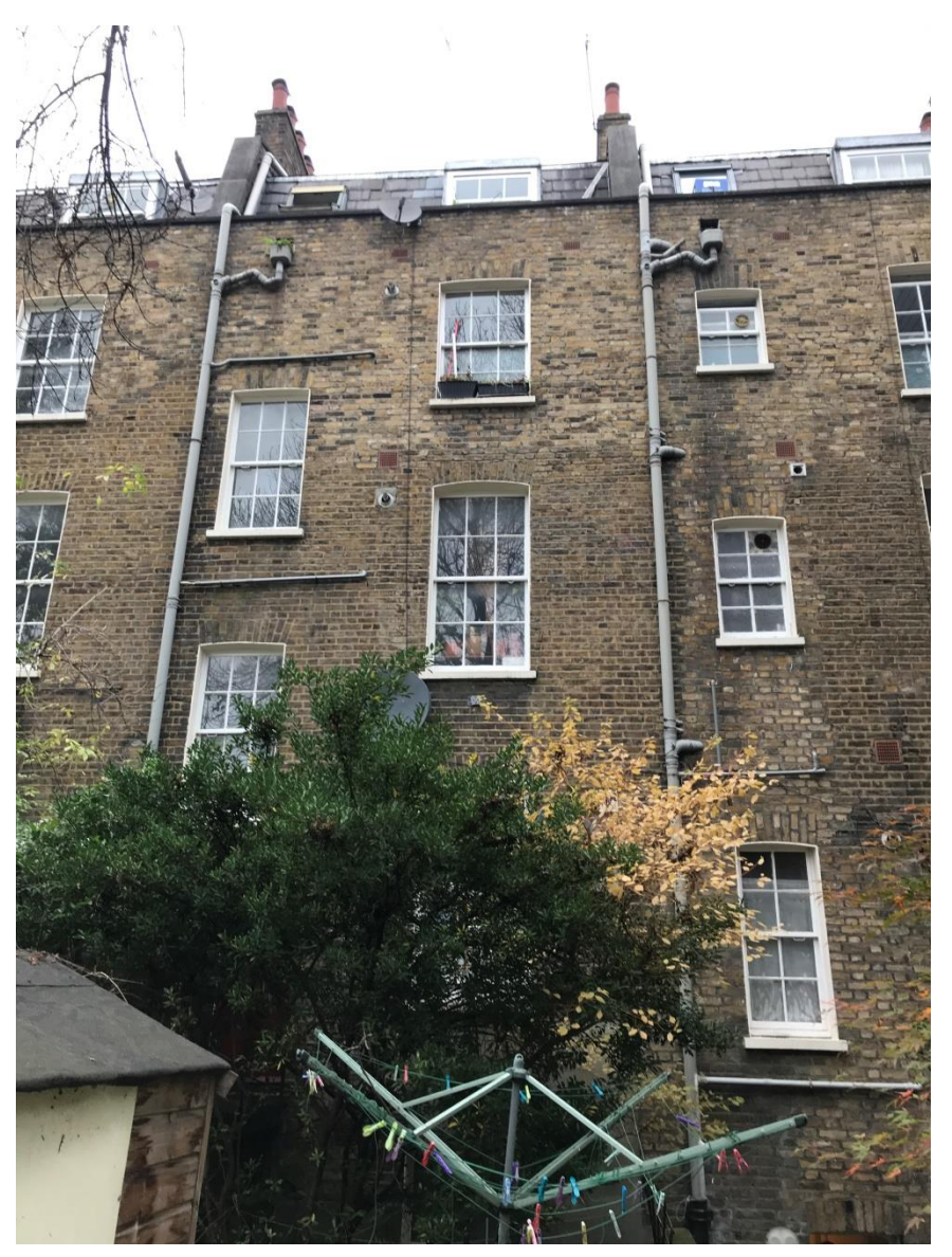
Rear Elevation of No. 29/31 Swinton Street