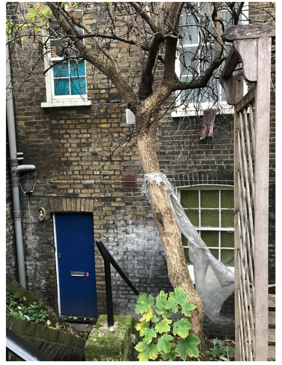
Front Door To Flat 2