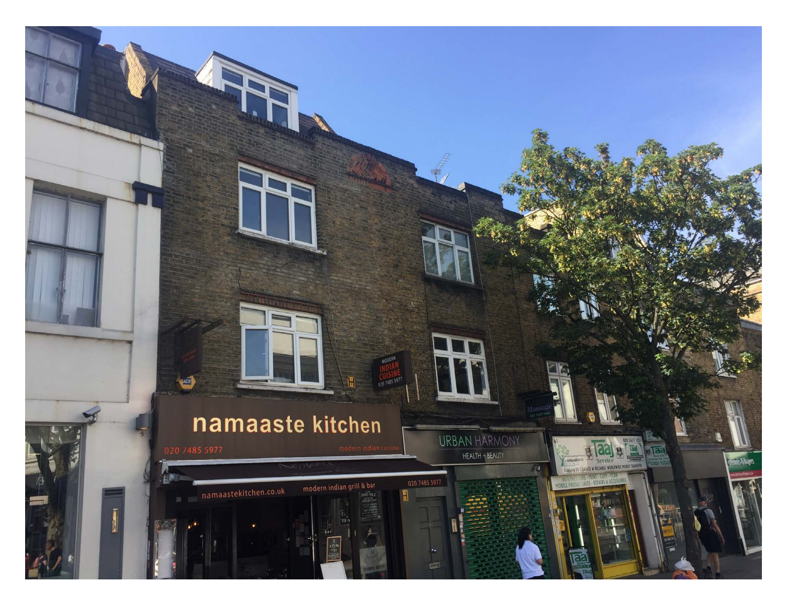
No.s 56-66 - Near neighbours with varied style plastic, timber and metal windows and shallow reveal depths.

Subject Building in context with immediate neighbours - eclectic mix of buildings, materials and windows.