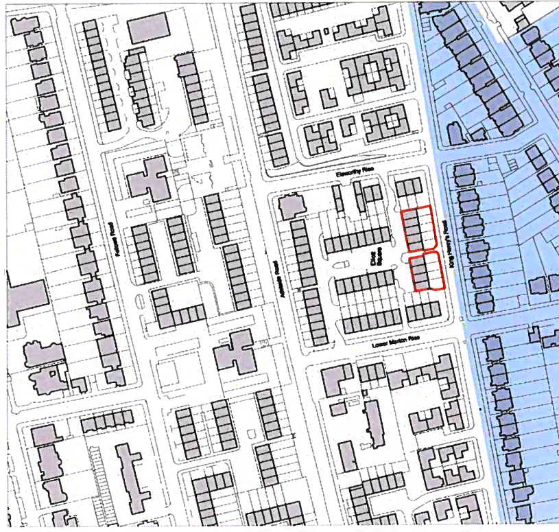
Location Plan (Scale 1:1250)

Handwritten notes and signatures on the right side of the site plan, including 'BA', 'AS', 'CS', and 'BA'.