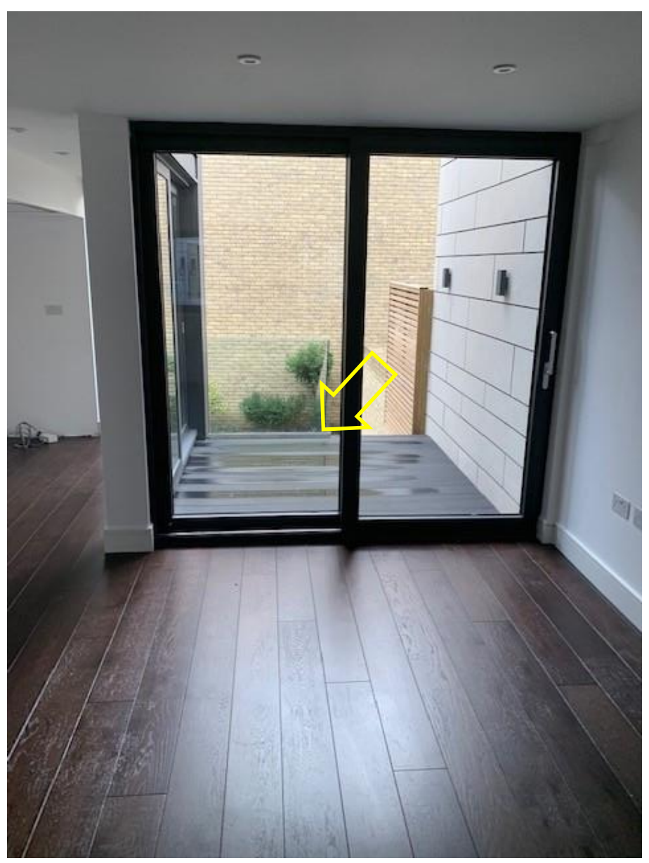
Photo.1 View from within No.17 looking out over terrace towards the garden. Arrow indicates extent of proposed extension.

The property currently consists of a three bedroom unit arranged over four floors and is a mid-terrace within a run of four.