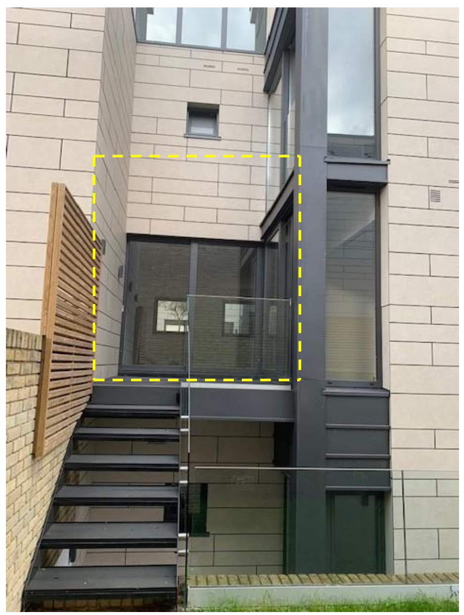
Photo.4 View back towards terrace indicating area of in fil extension.