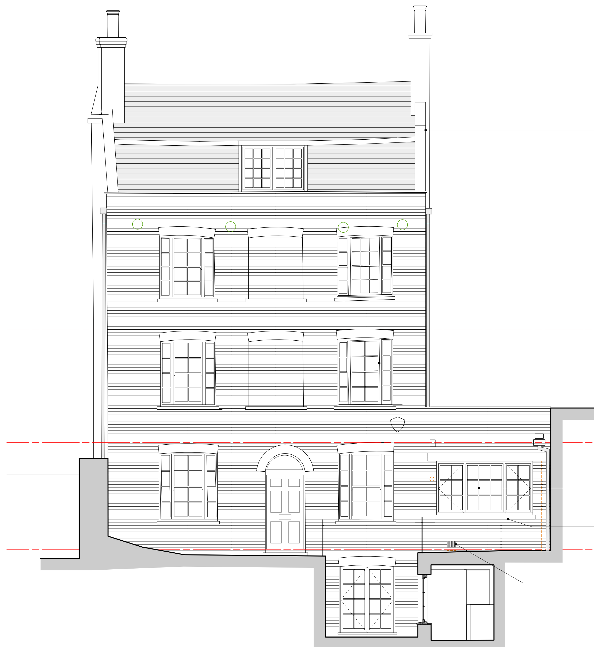
P 041.1 NORTH ELEVATION SCALE 1:50 @ A1, 1:100 @ A3