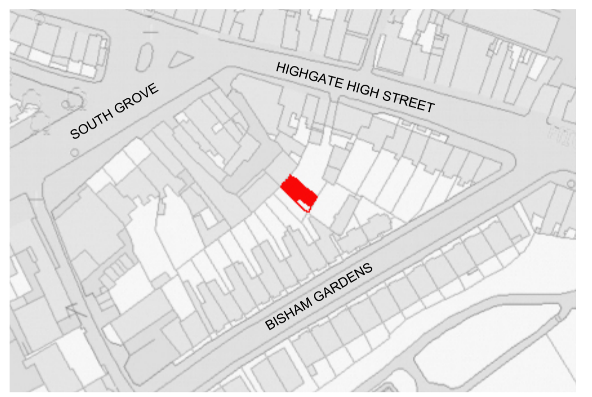
P 002.2 KEY PLAN SCALE 1:1250 @ A1, 1:2500 @ A3