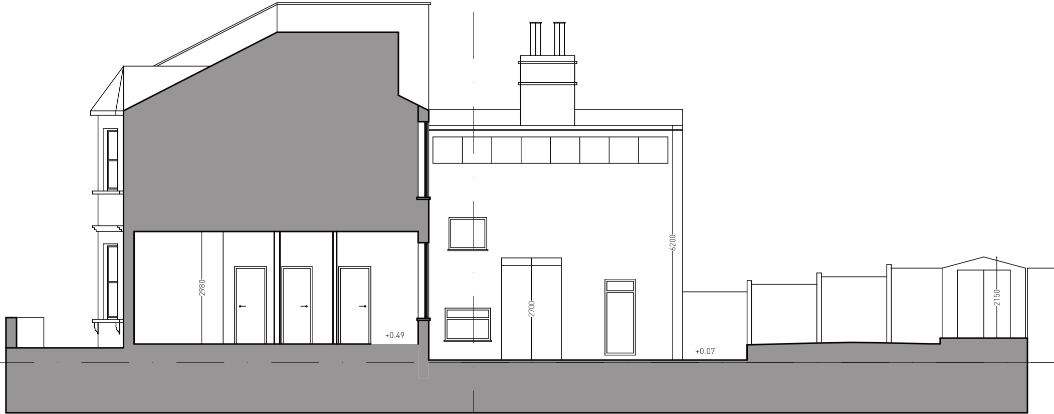
EXISTING SECTION C-C