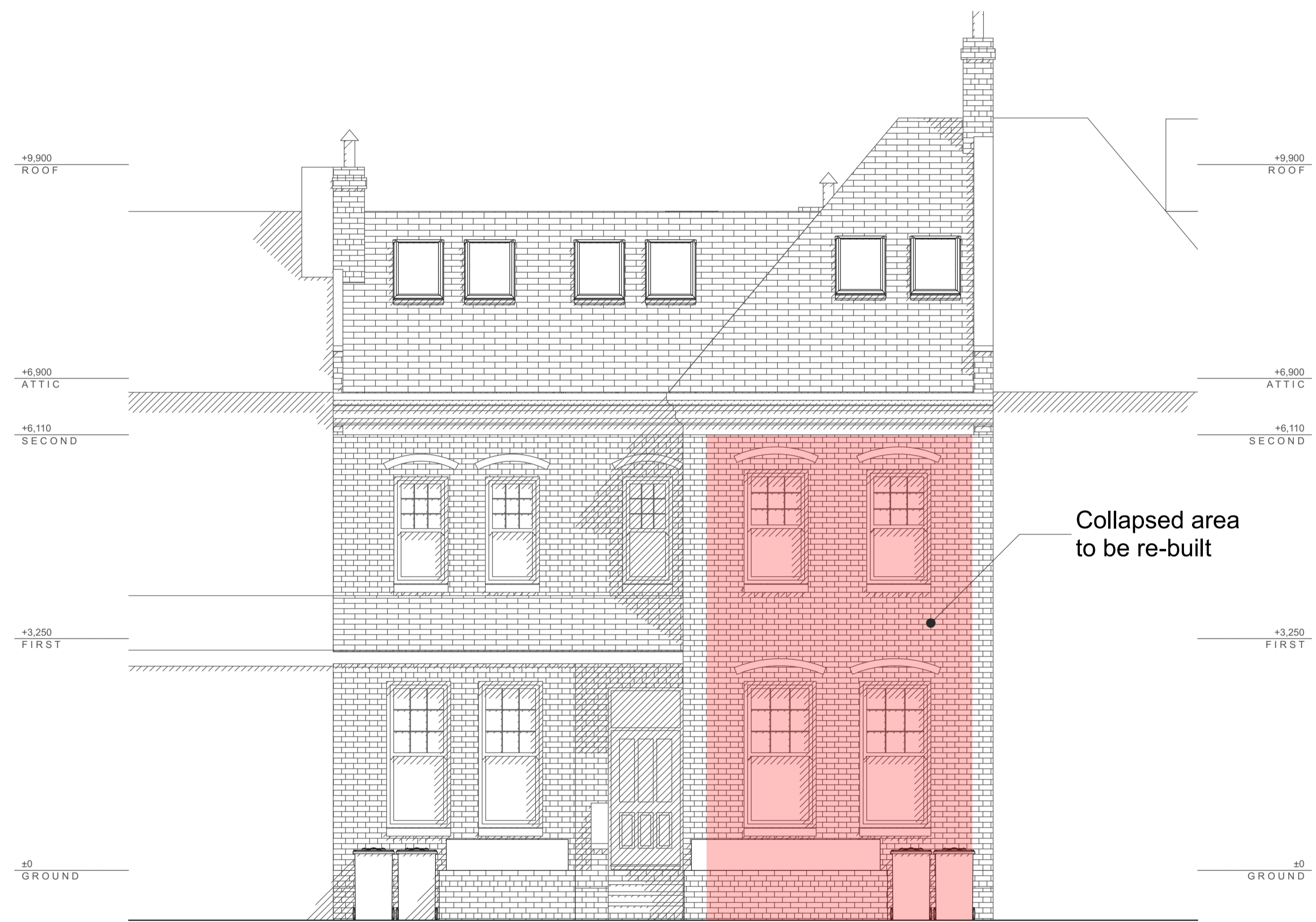
EXISTING NORTH ELEVATION 1:50