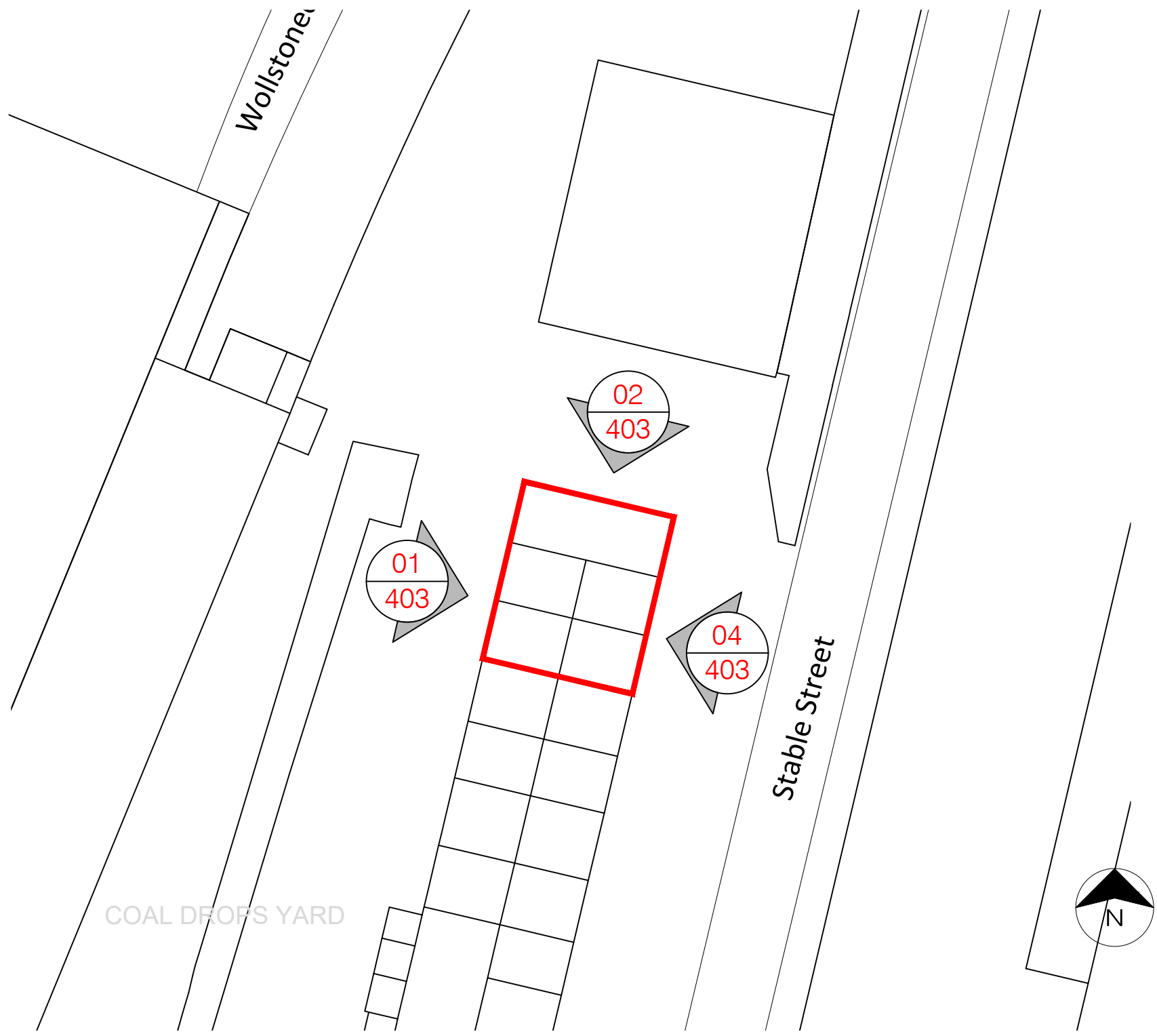
01 401 SITE BLOCK PLAN 1:500