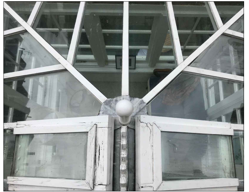
Photo of existing rotten conservatory roof structure