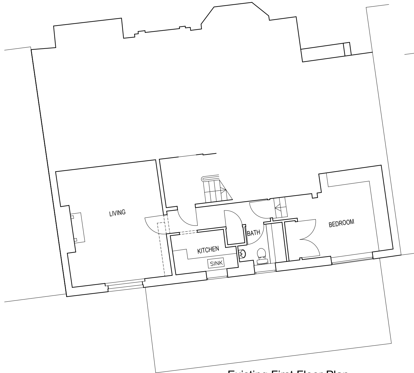
Existing First Floor Plan