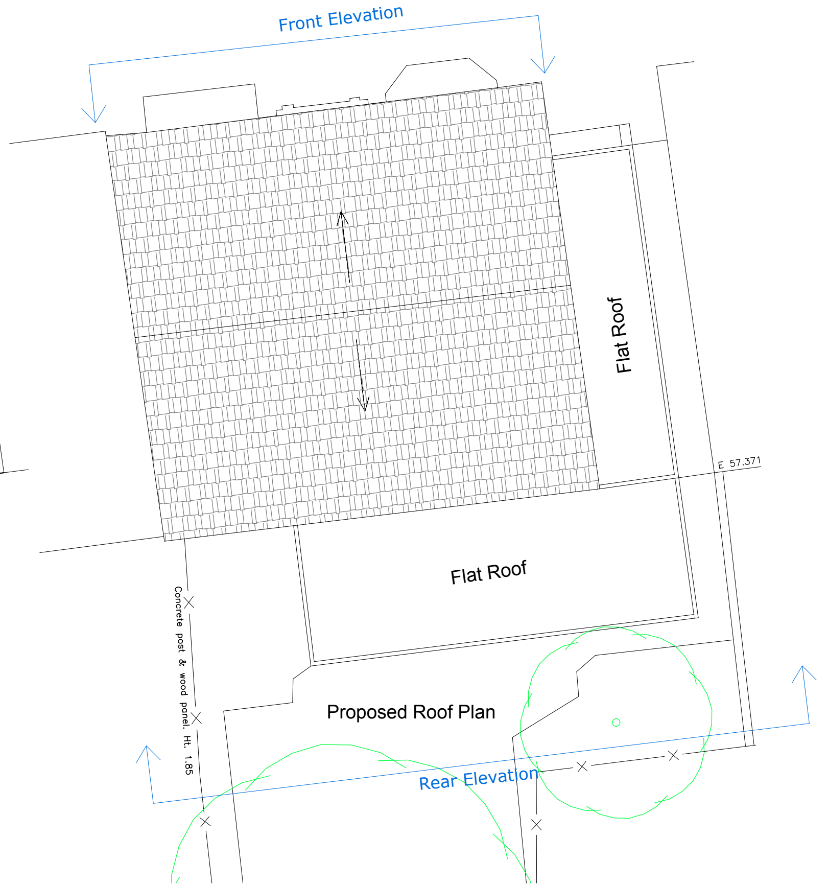
Proposed Roof Plan