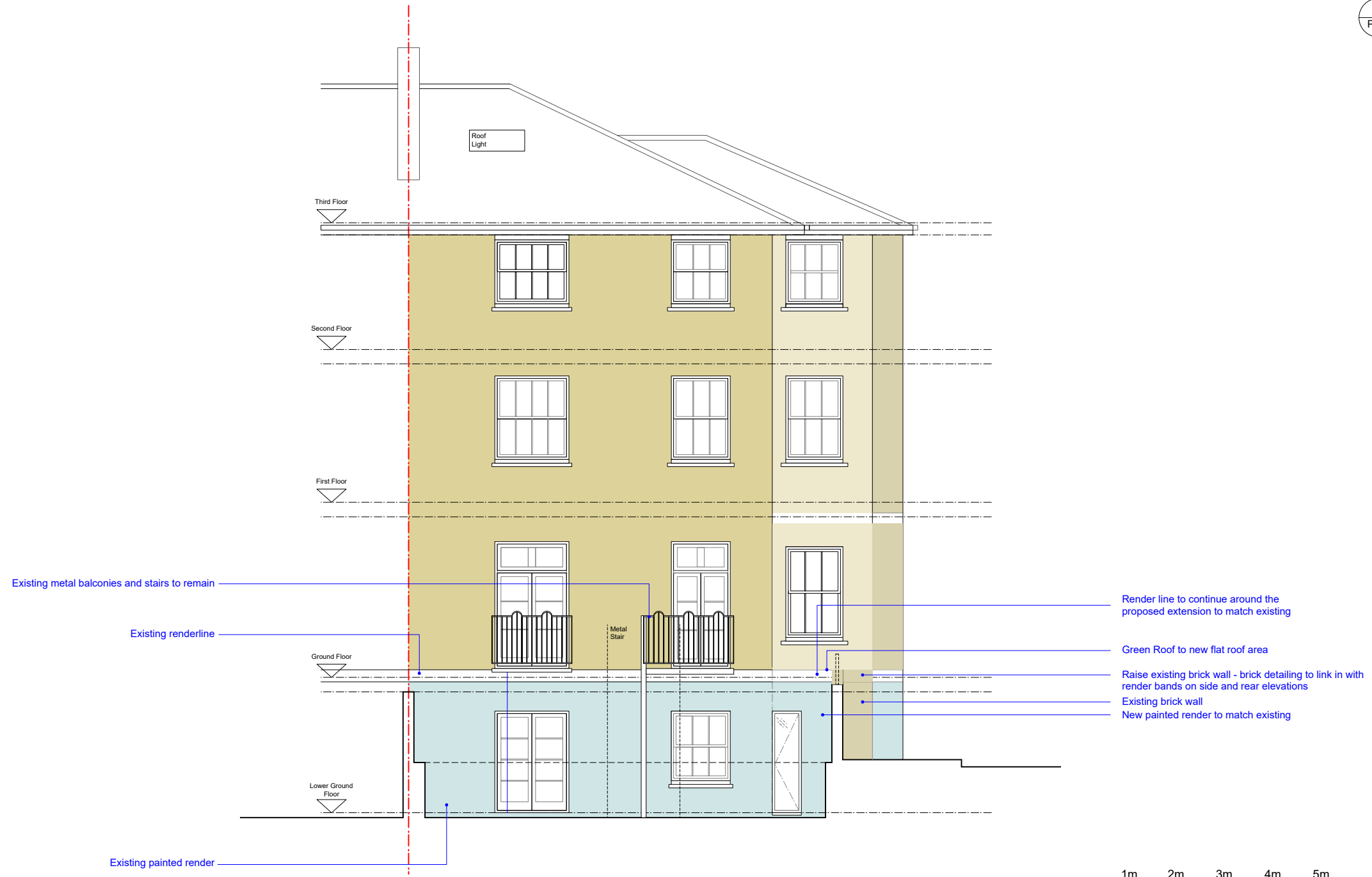
01 P202 proposed rear elevation scale 1:50@A1 1:100@A3