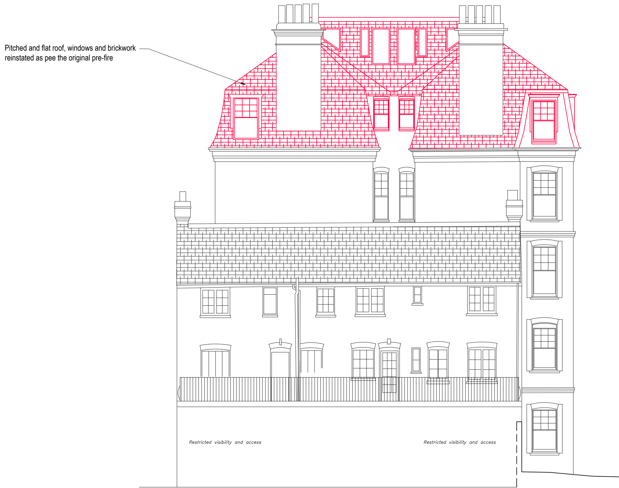
PROPOSED EAST ELEVATION Scale 1:100