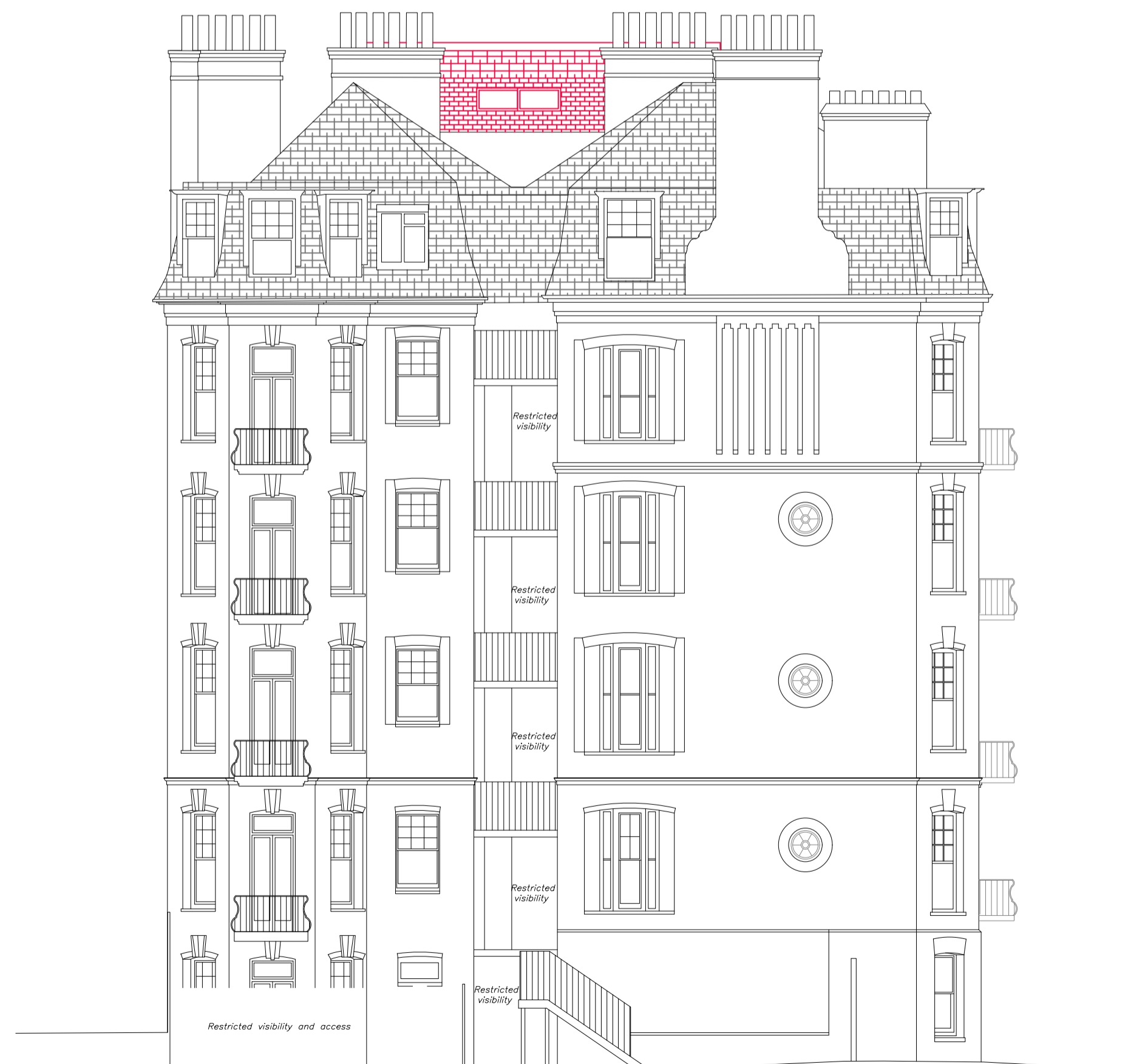
EXISTING WEST ELEVATION Scale 1:100