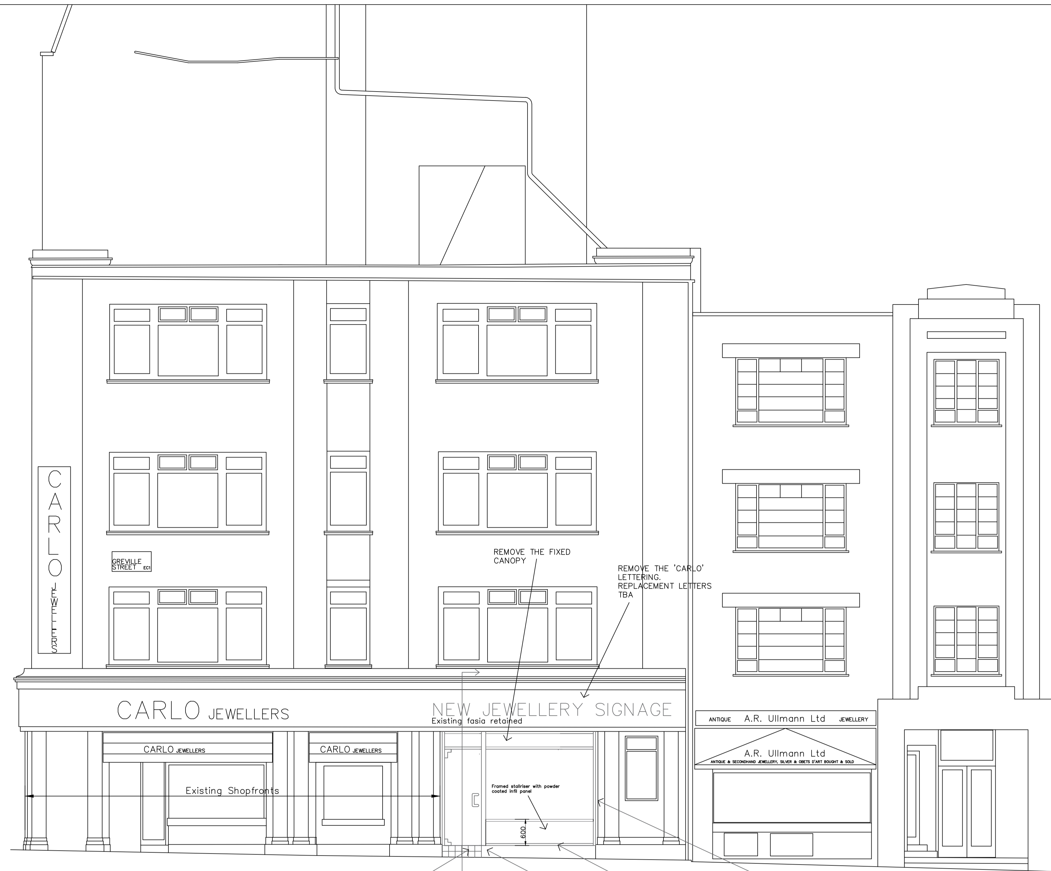
GREVILLE STREET ELEVATION