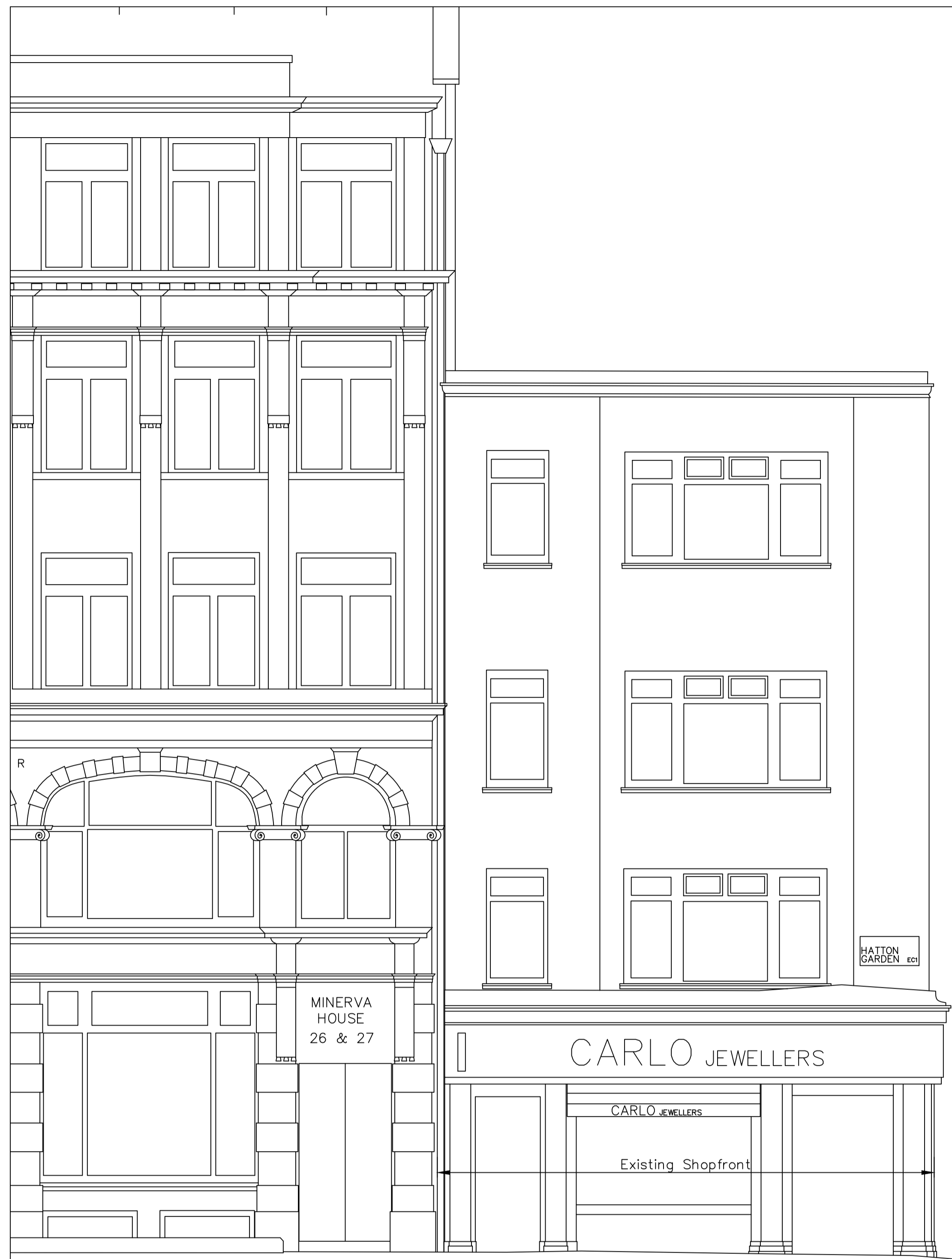
HATTON GARDEN ELEVATION