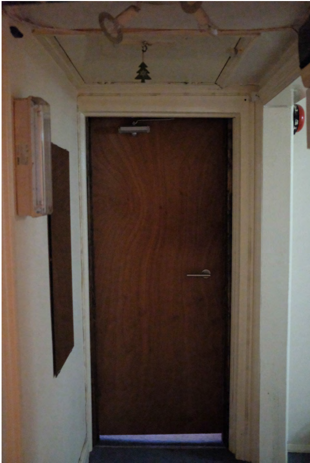
3D. Corridor/ Lobby 3114.JPG