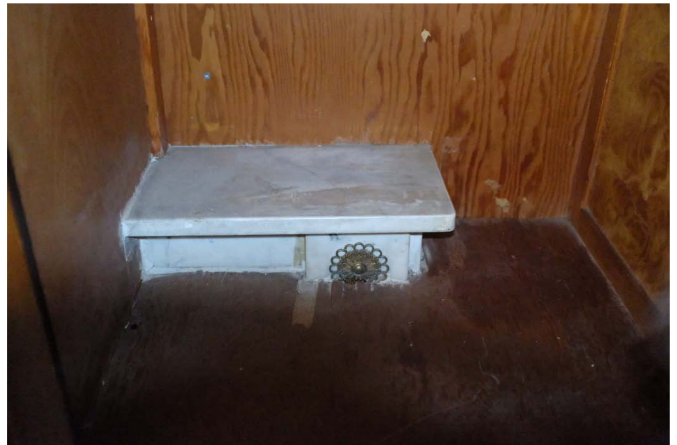
3C. Front Left Room 3106.JPG