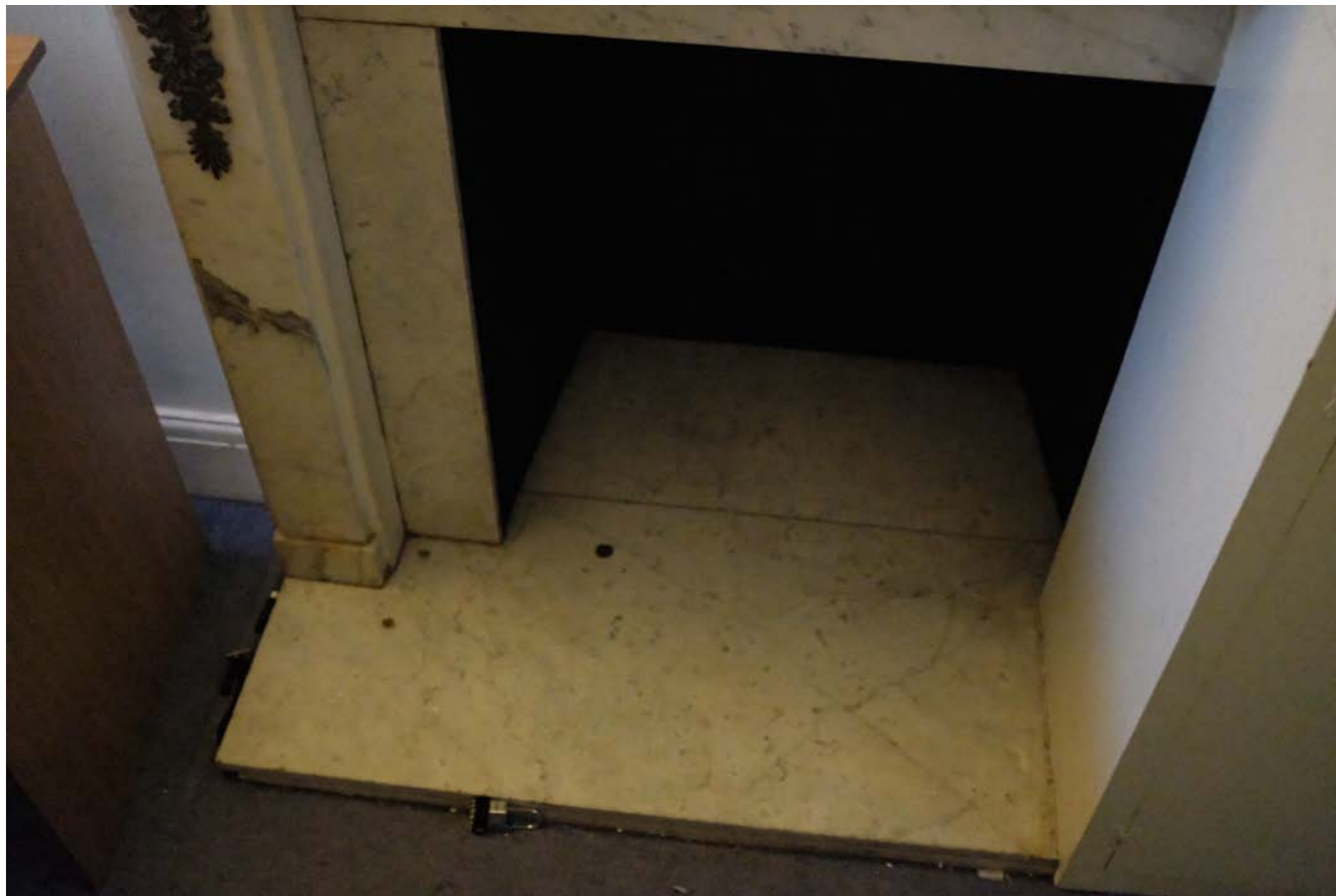
3C. Front Left Room 3102.JPG