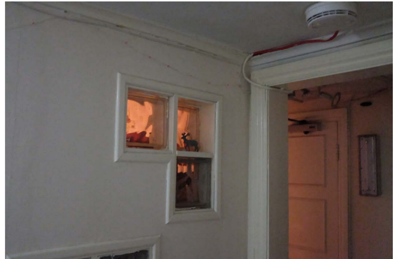
3D. Corridor/ Lobby 3097.JPG