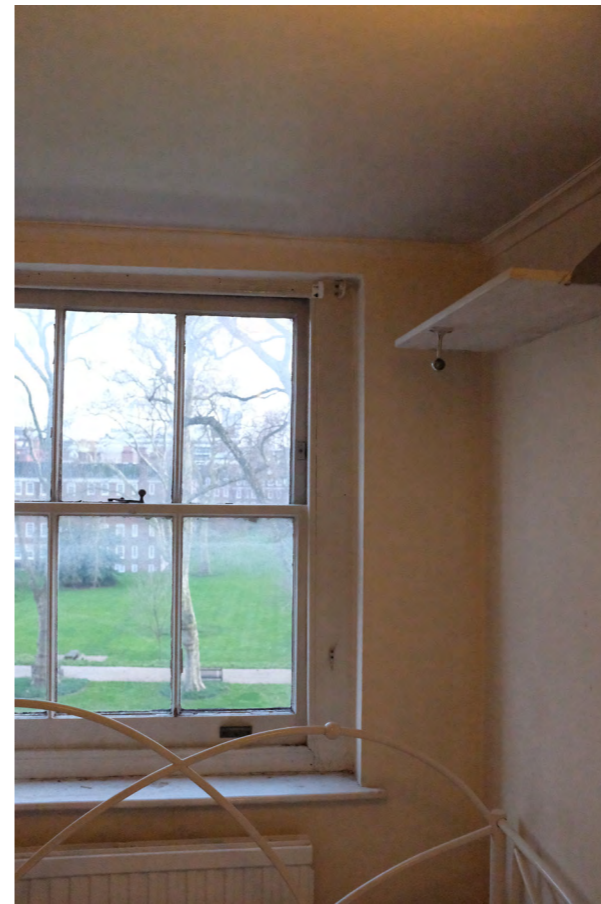
3C. Front Left Room 3103.JPG