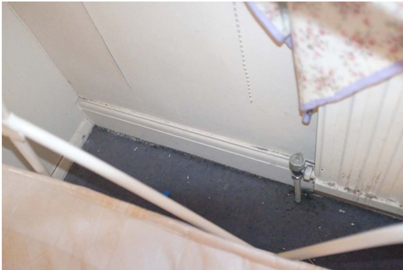
3C. Front Left Room 3107.JPG