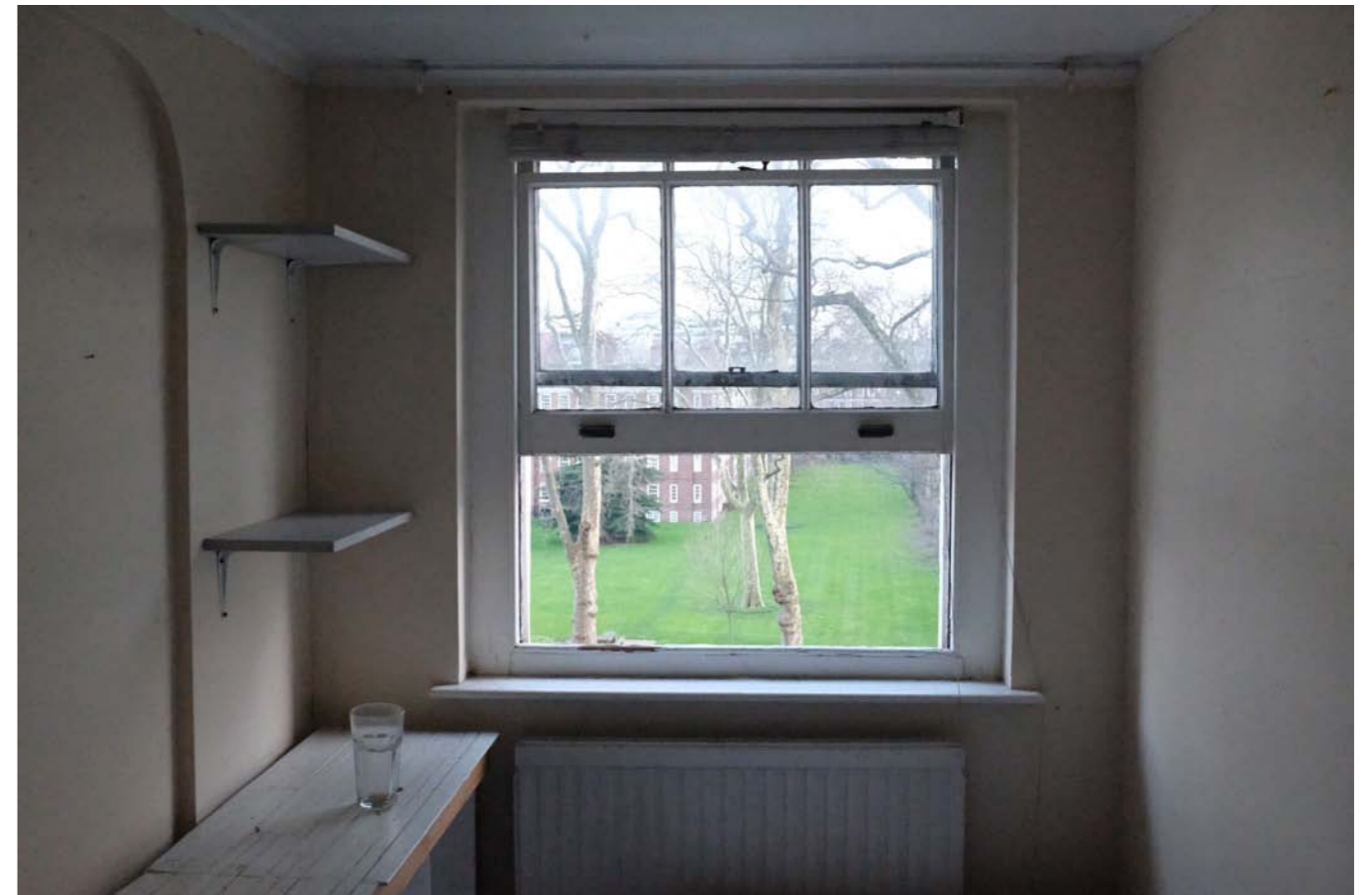
3B. Front Middle Room 3095.JPG