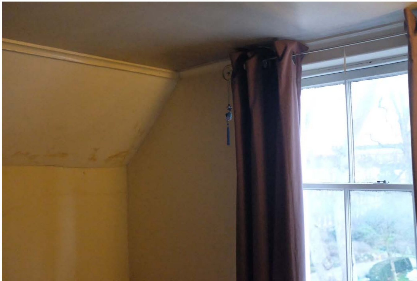
3A. Front Right Room 3088.JPG