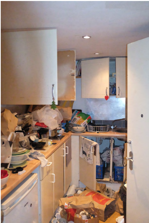
3F. Back Left Room 3111.JPG