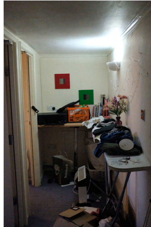
3E. Kitchen 3110.JPG