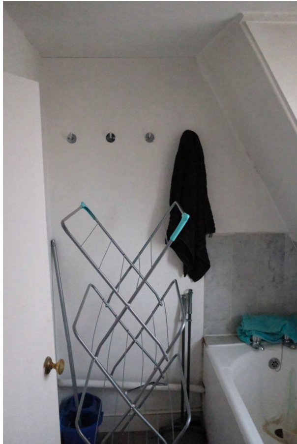
3G. Back Right Room 3117JPG