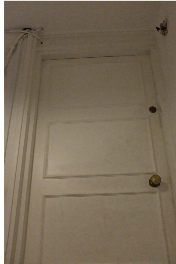
2J. Second to Attic Storey Stairwell 3086.JPG