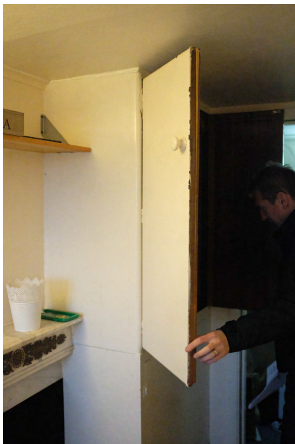
3C. Front Left Room 3104.JPG