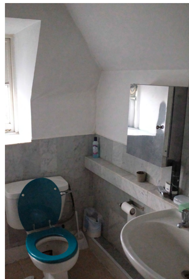
3G. Back Right Room 3115.JPG