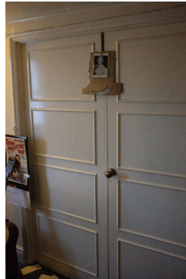
3A. Front Right Room 3090.JPG