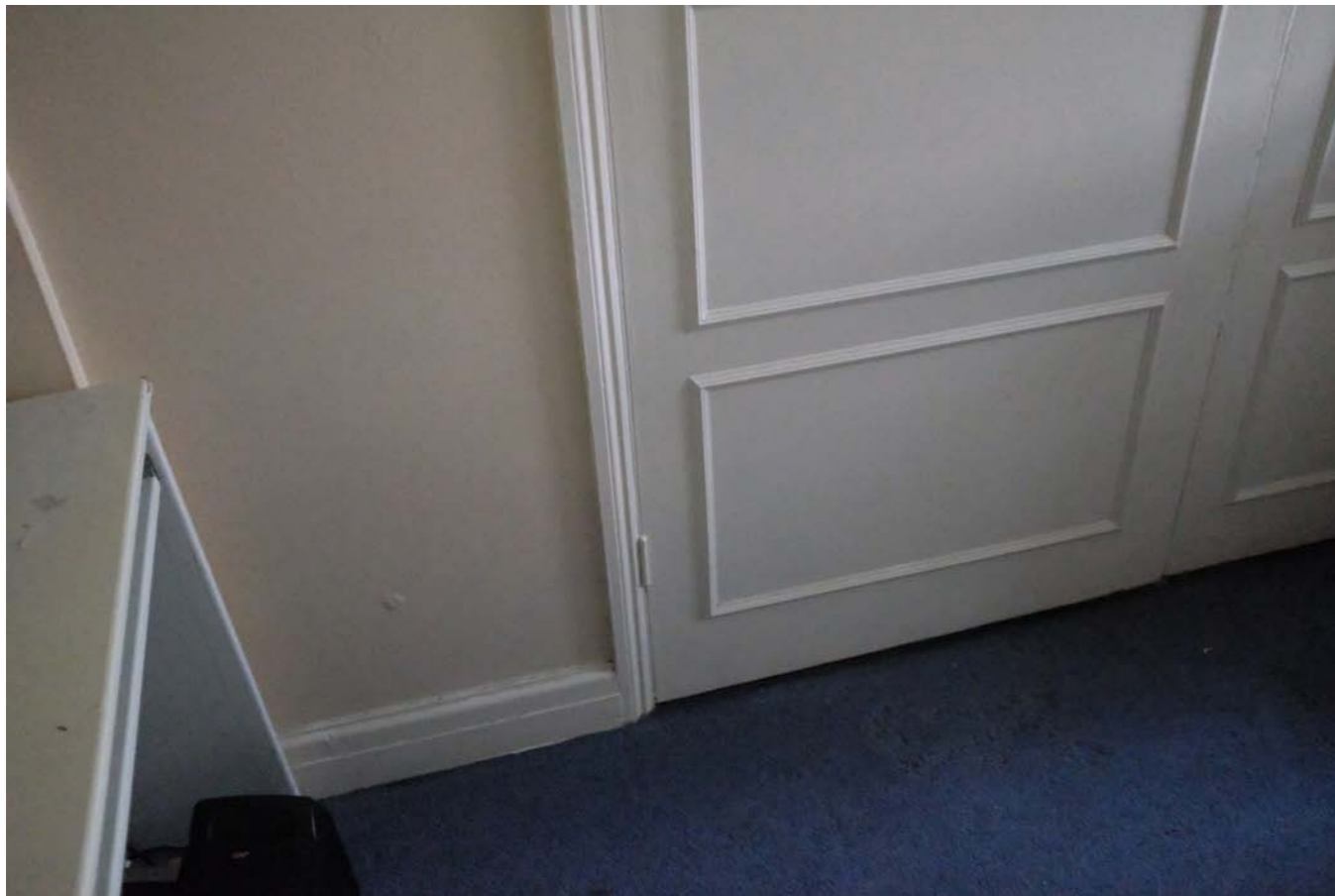
3B. Front Middle Room 3093.JPG