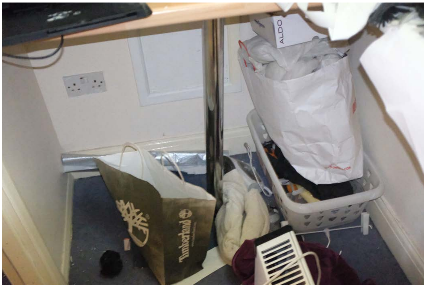
3D. Corridor/ Lobby 3109.JPG