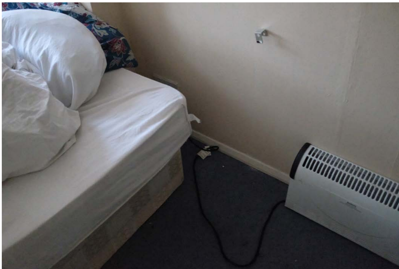
3B. Front Middle Room 3096.JPG