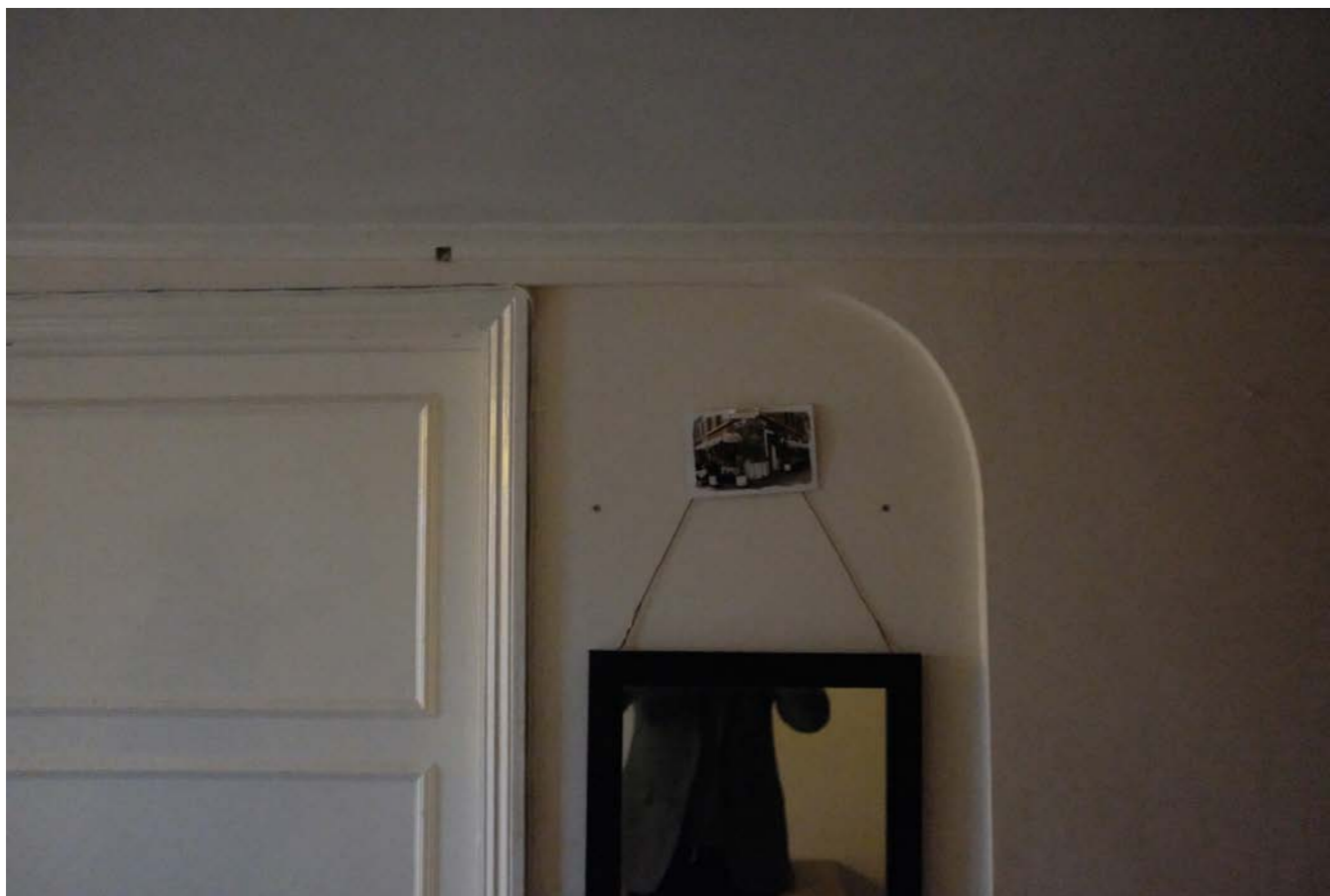
3A. Front Right Room 3091.JPG