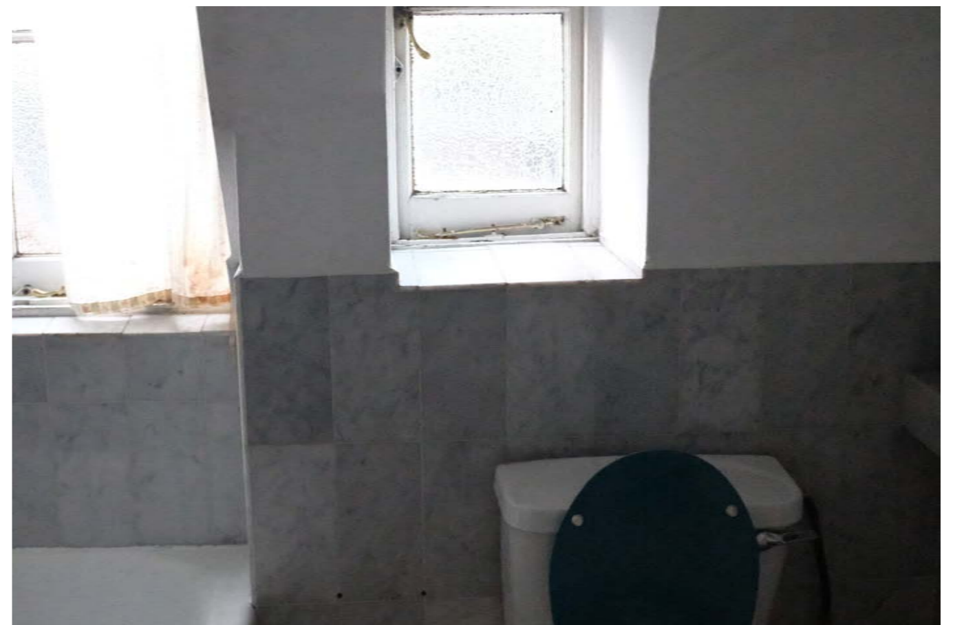
3G. Back Right Room 3116.JPG