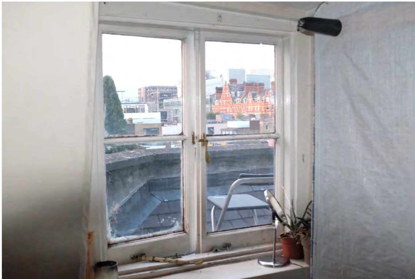
3F. Back Left Room 3127.JPG