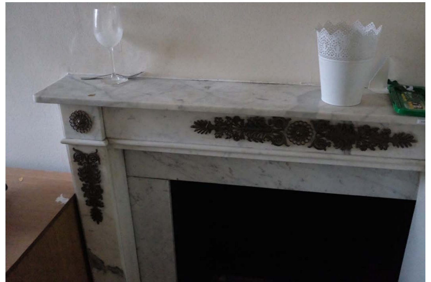
3C. Front Left Room 3099.JPG