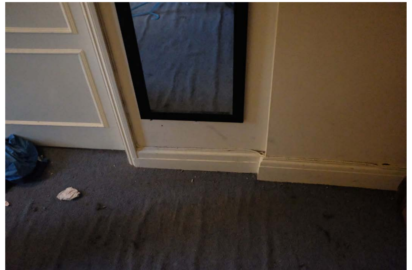
3A. Front Right Room 3092.JPG