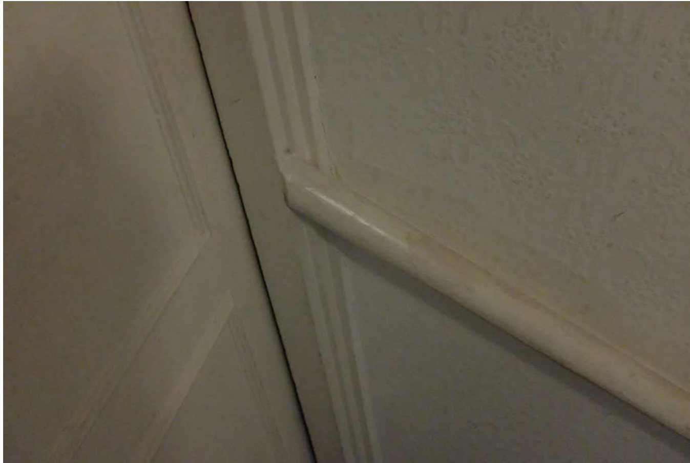
2J. Second to Attic Storey Stairwell 3085.JPG