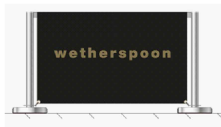
EXAMPLE OF BREEZEFREE BARRIER

REVISIONS REV A: THREE PLANTERS AT FRONT OF BUILDING REMOVED. PLANTER REMOVED NEXT TO STREET LAMP. BREEZEFREE BARRIERS ADDED.