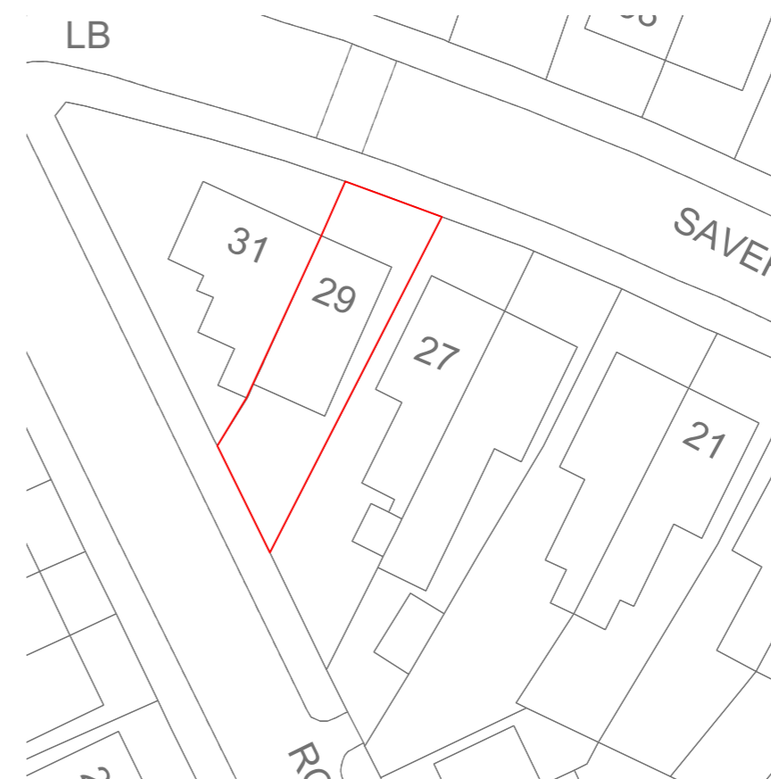
1: 500 Site location plan