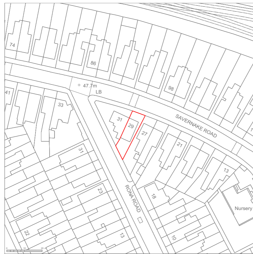
1: 1250 Site location plan