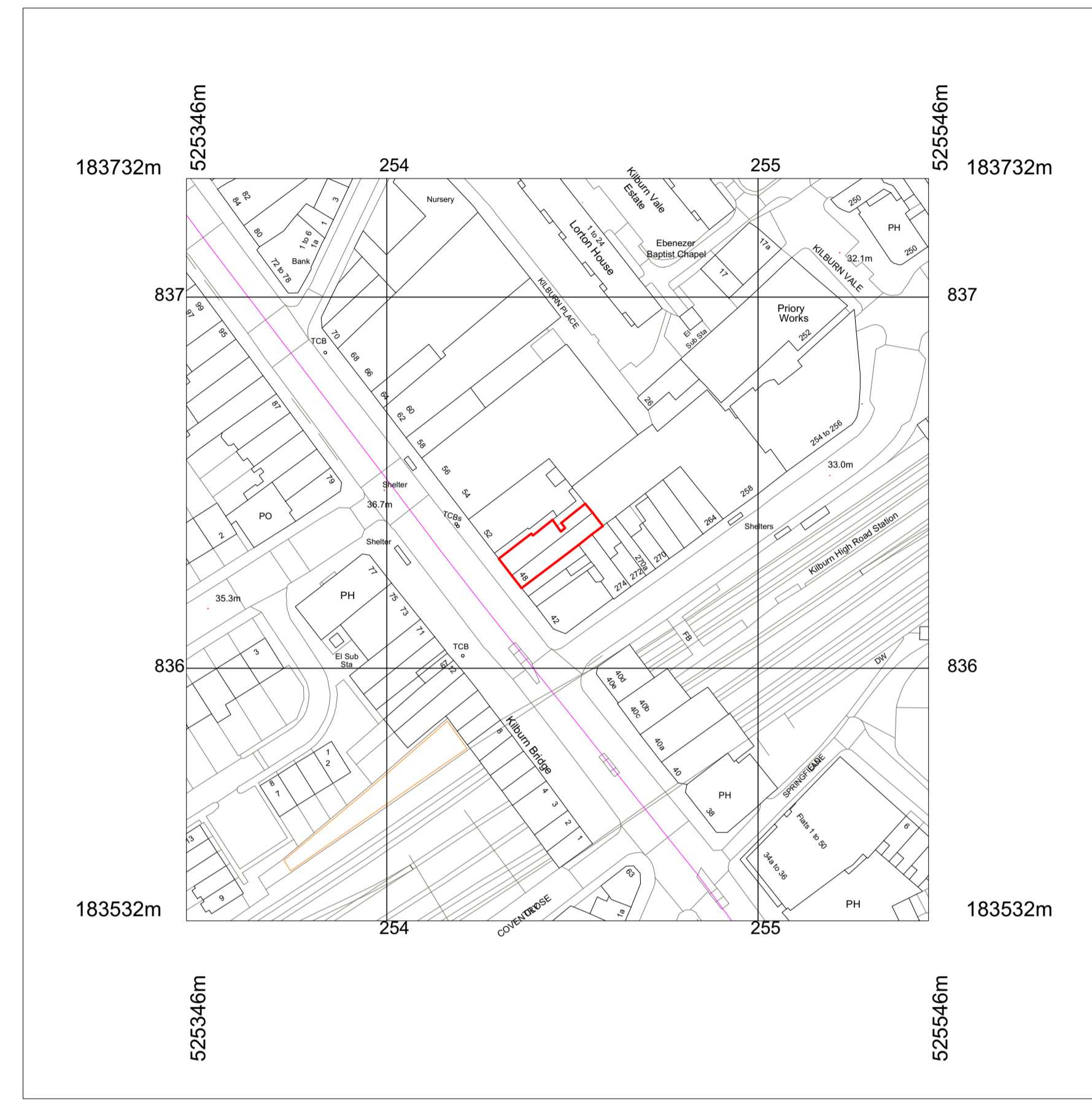
LOCATION PLAN 1:1250 @ A3