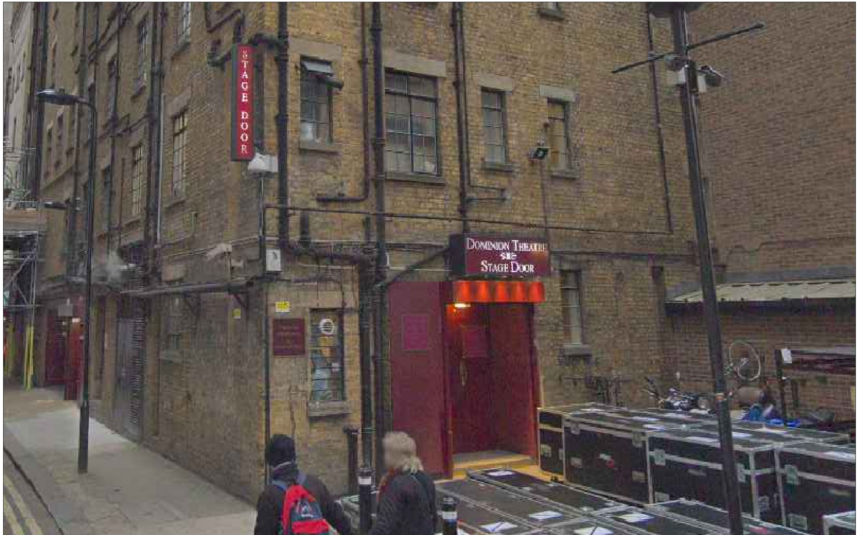
EXISTING ELEVATION SHOWING STAGE DOOR (NTS)

THIS DRAWING AND THE COMPUTER FILE OF THIS DRAWING ARE COPYRIGHT. THE COPYRIGHT BELONGS TO MICHAEL JACKSON CONSULTING ENGINEERS LIMITED (MJCE LIMITED). THIS DRAWING MAY THEREFORE, NOT BE REPRODUCED IN ANY FORMAT WITHOUT THE WRITTEN CONSENT OF MJCE LIMITED AND THE COMPUTER FILE MAY NOT BE TRANSFERRED WITHOUT THE WRITTEN CONSENT OF MJCE LIMITED.