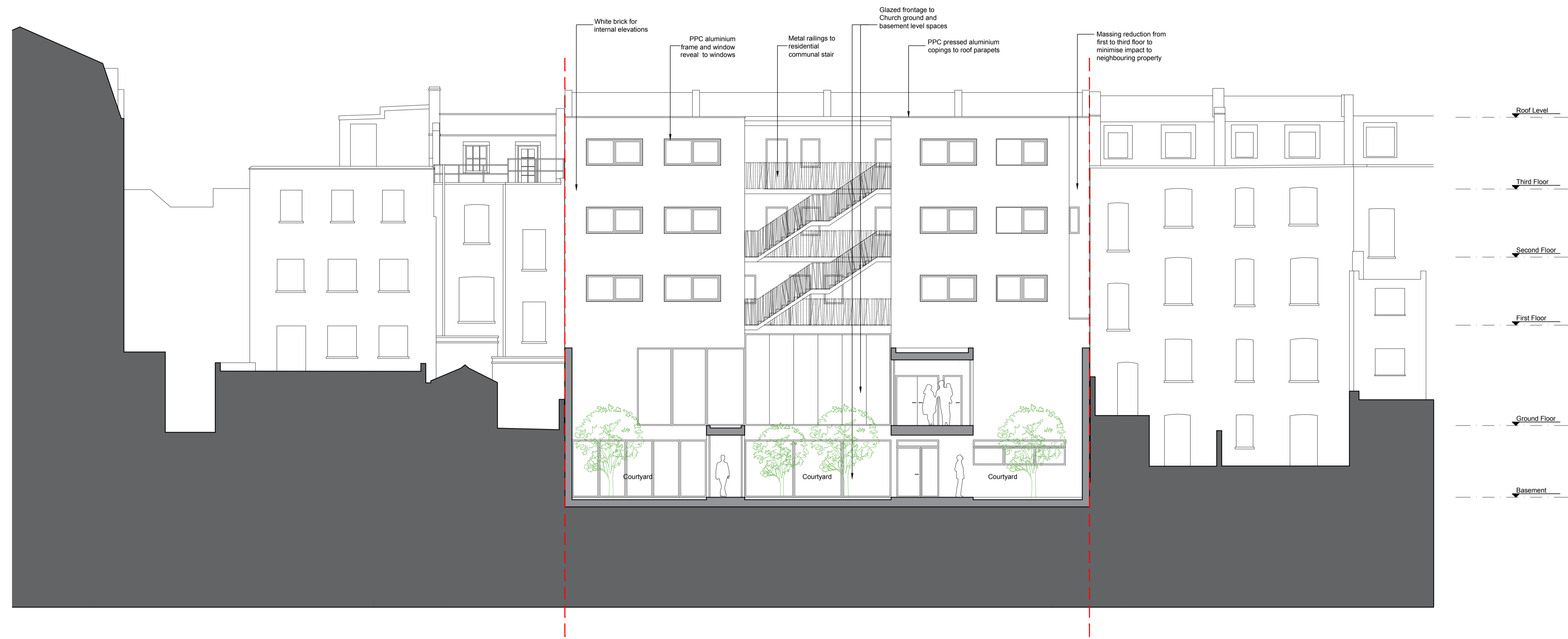
Proposed Section DD Scale 1:200 @A3 1:100 @A1