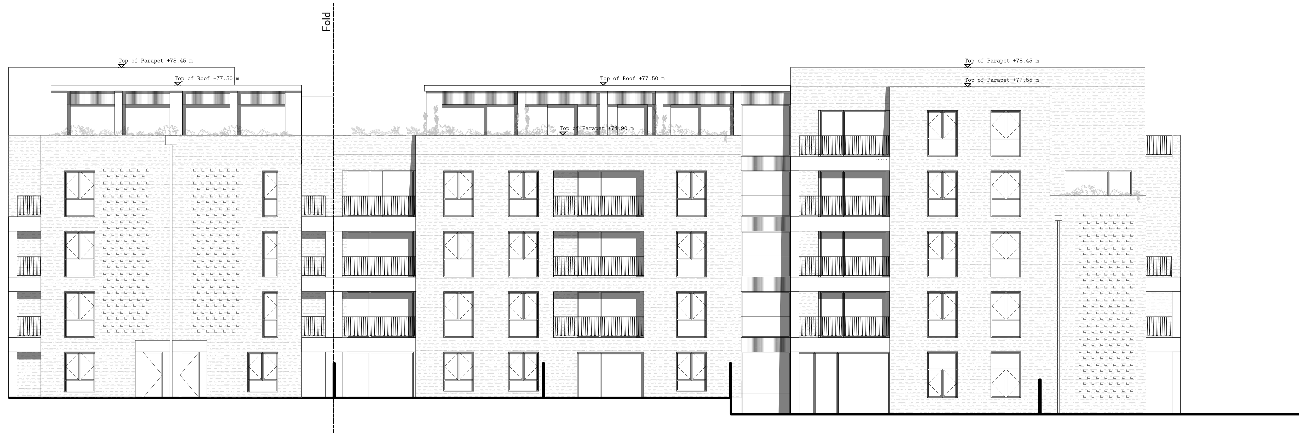
D Building A Elevation