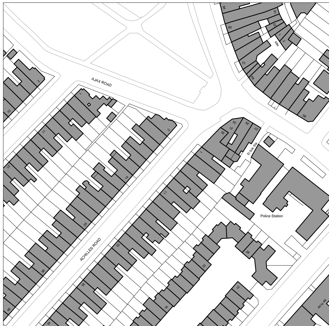
01 _ SITE LOCATION PLAN - 1:500