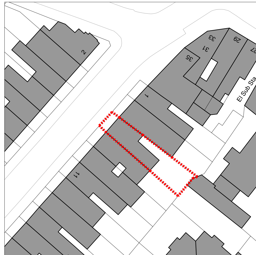
02 _ BLOCK PLAN - 1:500