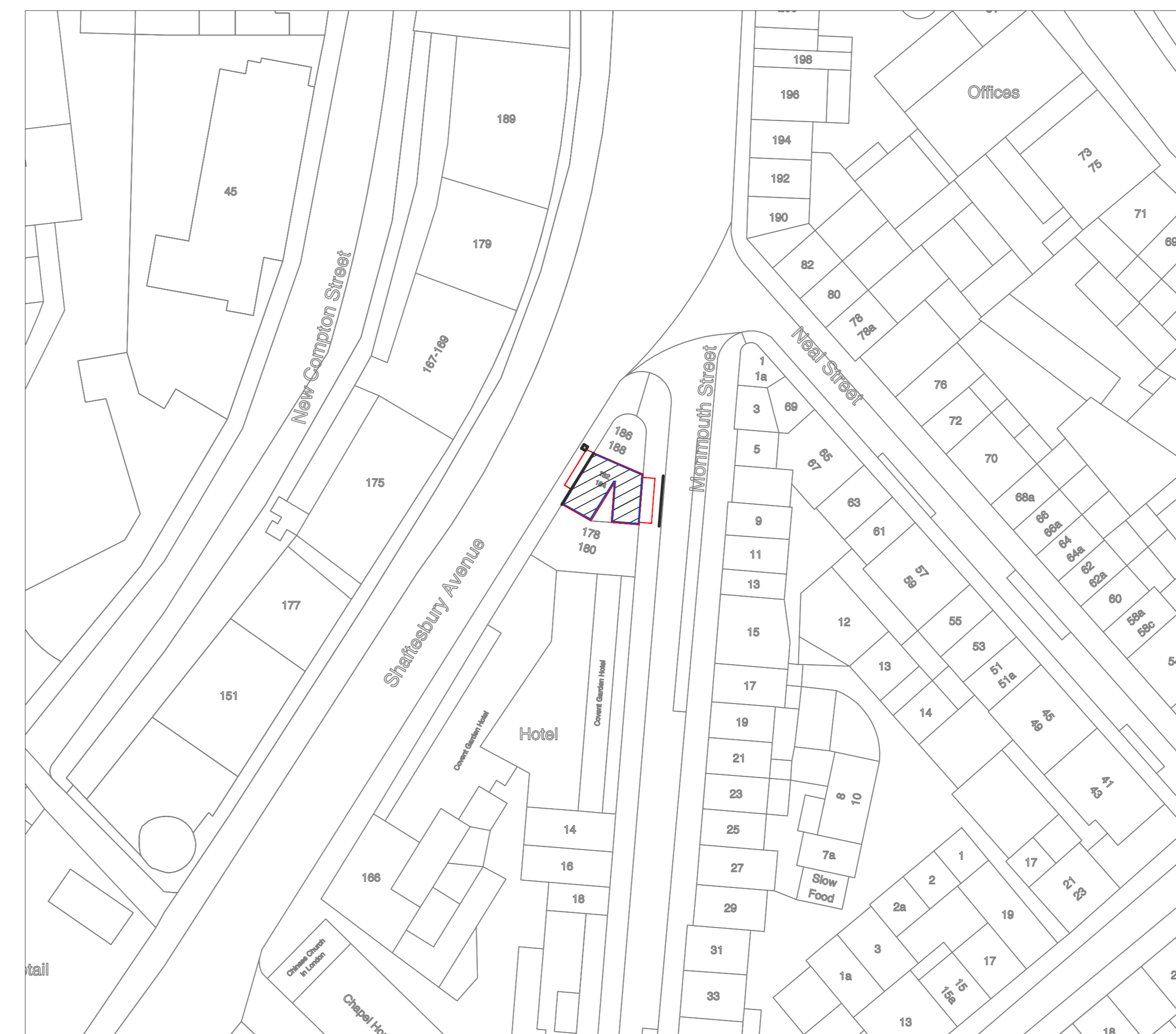
SITE LOCATION PLAN 1:500 @ A0