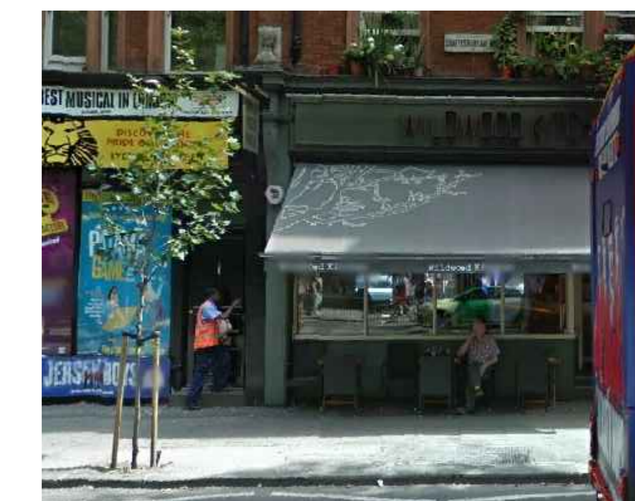
GOOGLE VIEW TREE TO LEFT SIDE OF WILDWOOD SITE