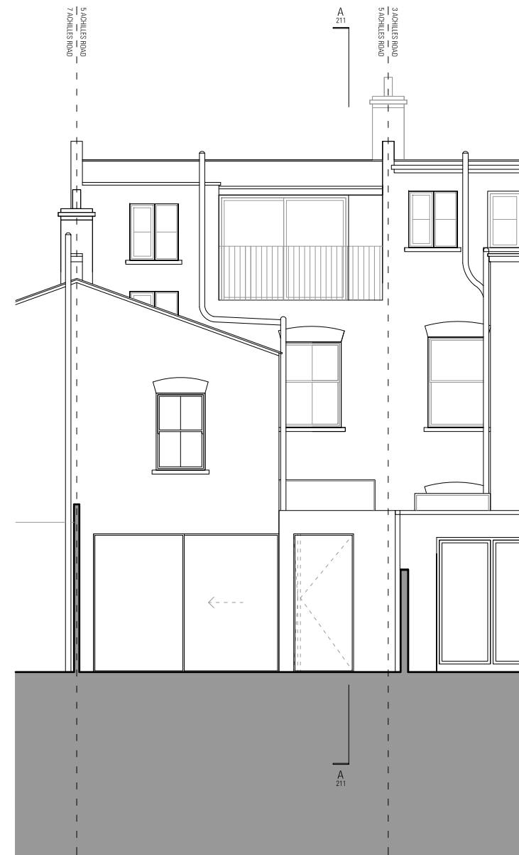
02 _ PROPOSED REAR ELEVATION