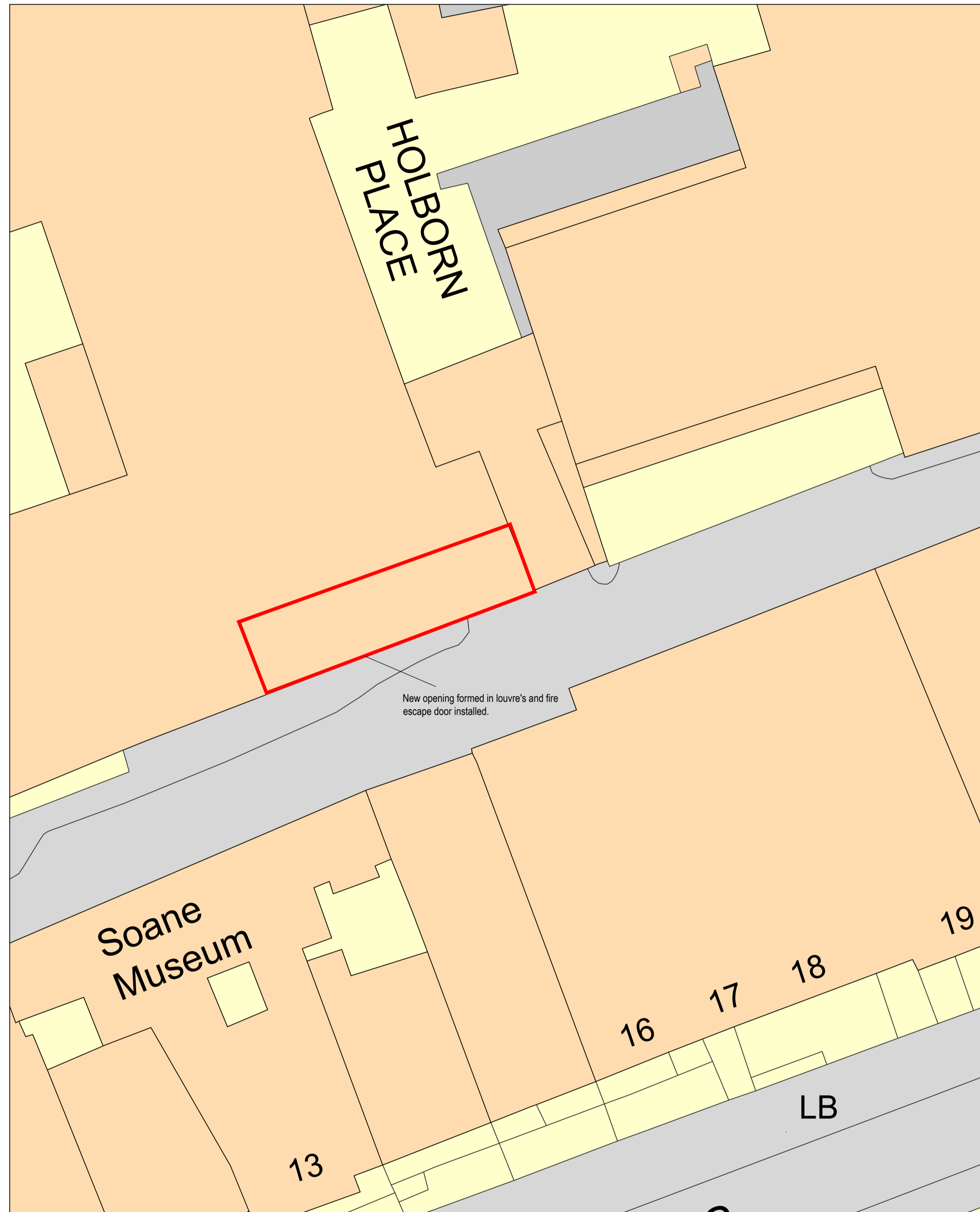
Site Block Plan SCALE 1:200@A1