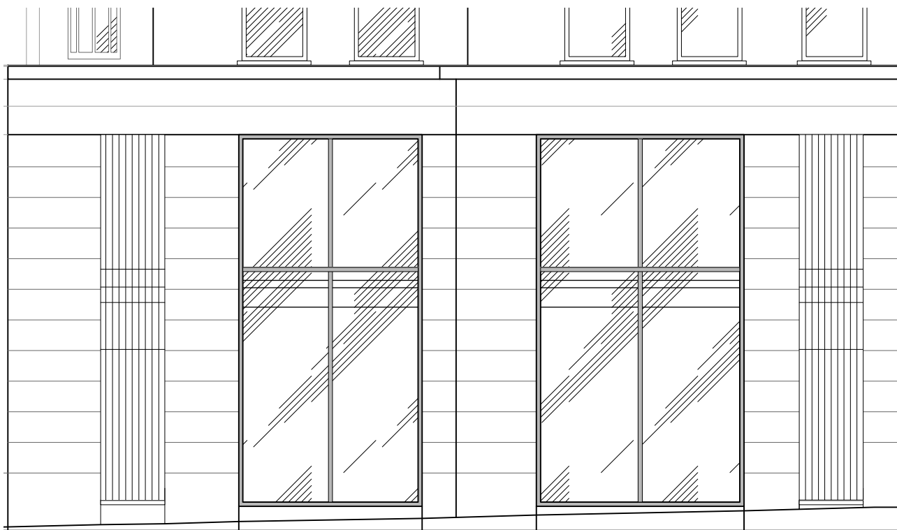
02 ELEVATION B 1:50 @ A1 1:100 @ A3

Notes This drawing should not be scaled. The contractor is to verify all dimensions and conditions on site. This drawing is the property of Fusion and they reserve the copyright. It is issued on the understanding that it will not be copied, reproduced or disclosed in whole or in part to any unauthorised party without written permission from Fusion.