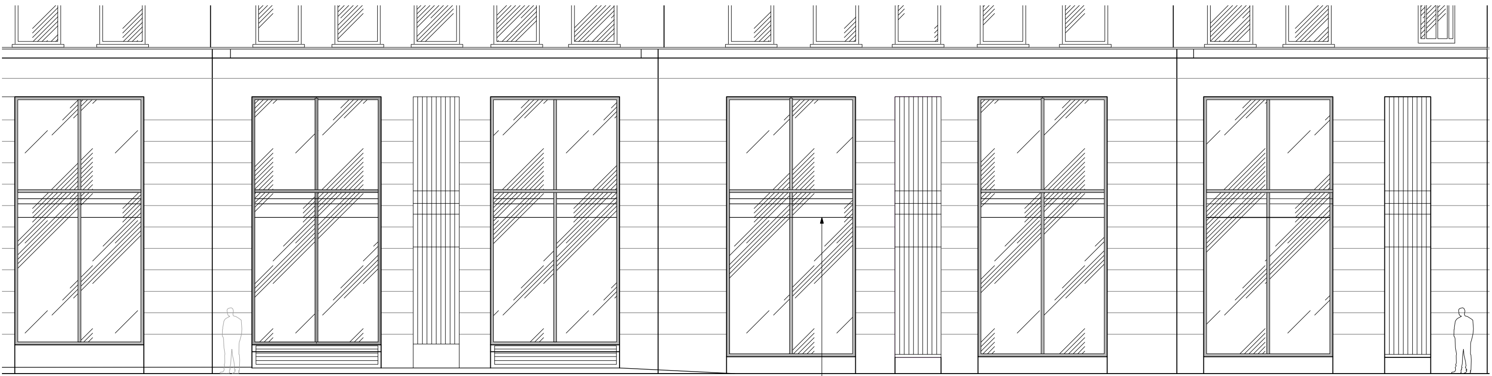
01 ELEVATION A 1:50 @ A1 1:100 @ A3

Notes This drawing should not be scaled. The contractor is to verify all dimensions and conditions on site. This drawing is the property of Fusion and they reserve the copyright. It is issued on the understanding that it will not be copied, reproduced or disclosed in whole or in part to any unauthorised party without written permission from Fusion.