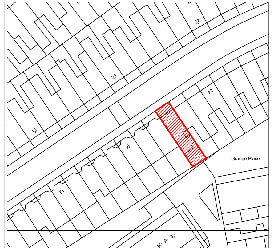
LOCATION PLAN Scale: 1:1250

NOTE: - All dimensions in this drawings are metric.