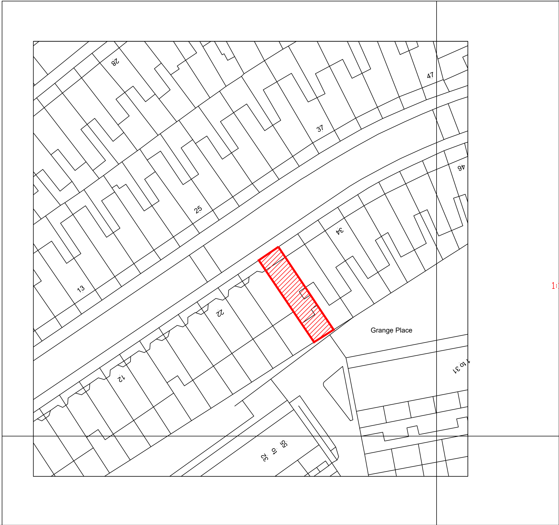
SITE PLAN Scale: 1:500