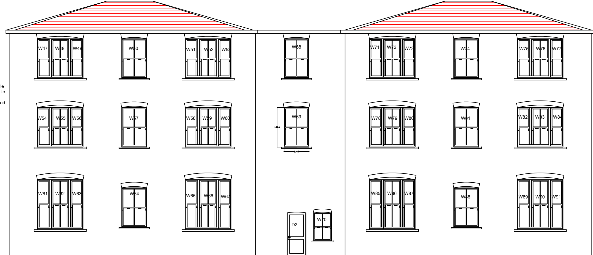
REAR ELEVATION (Proposed)

The fenestration will be followed on front, side and rear elevation.