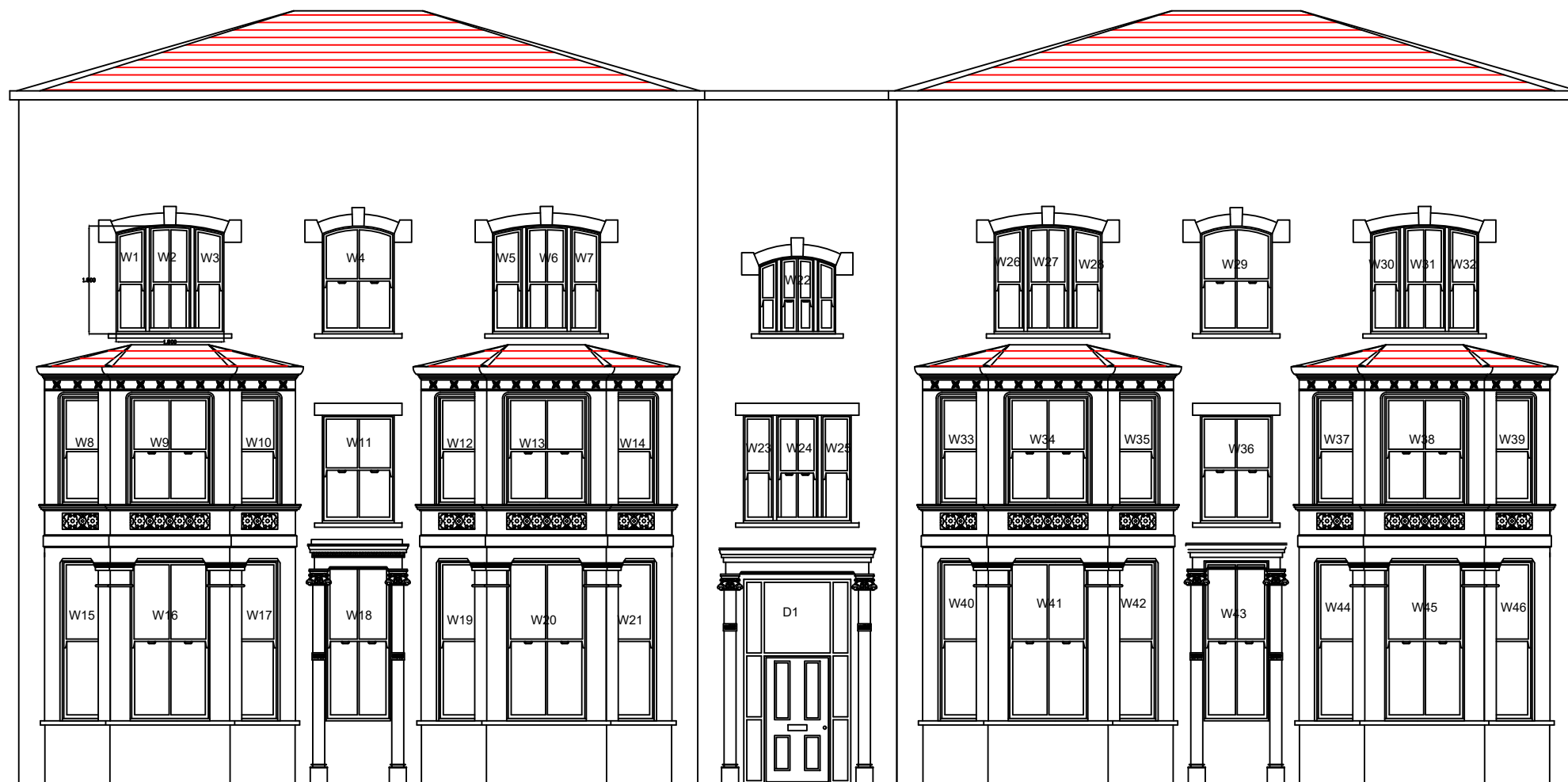
FRONT ELEVATION (Existing)

EXISTING TIMBER SINGLE GLAZED WINDOW TO BE REPLACED