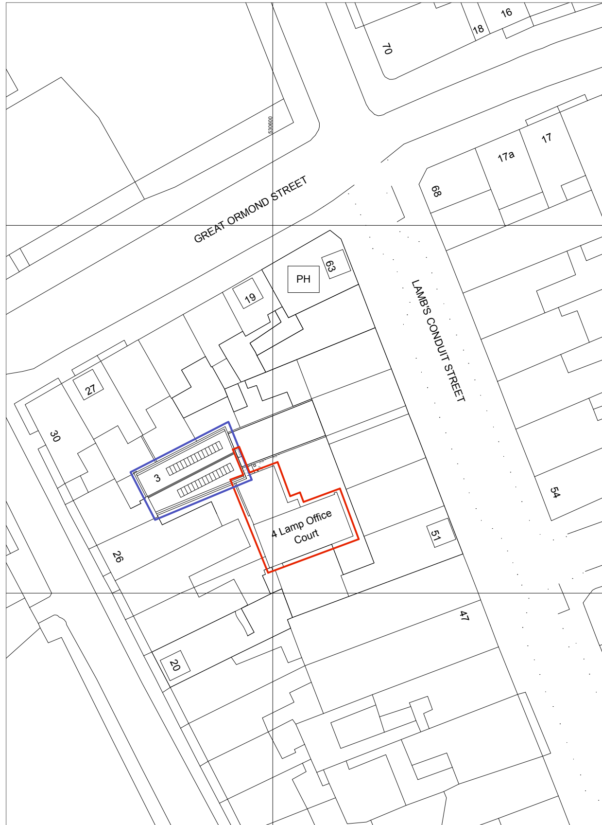
① SITE LOCATION PLAN 1:500@A3