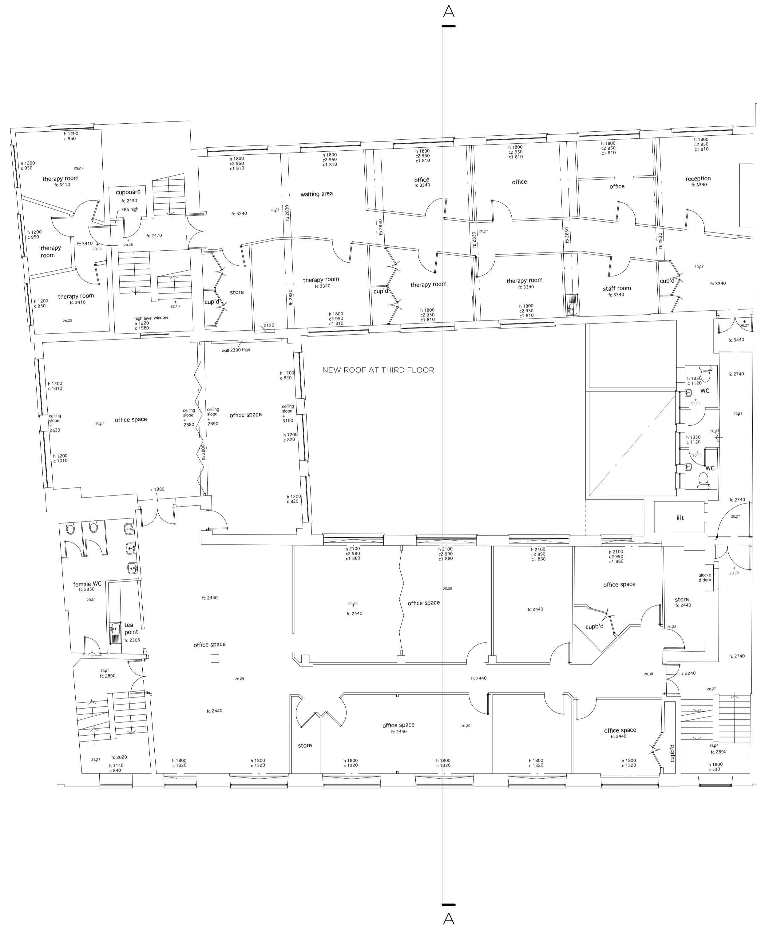
THIRD FLOOR PLAN _ AS PROPOSED 1:100