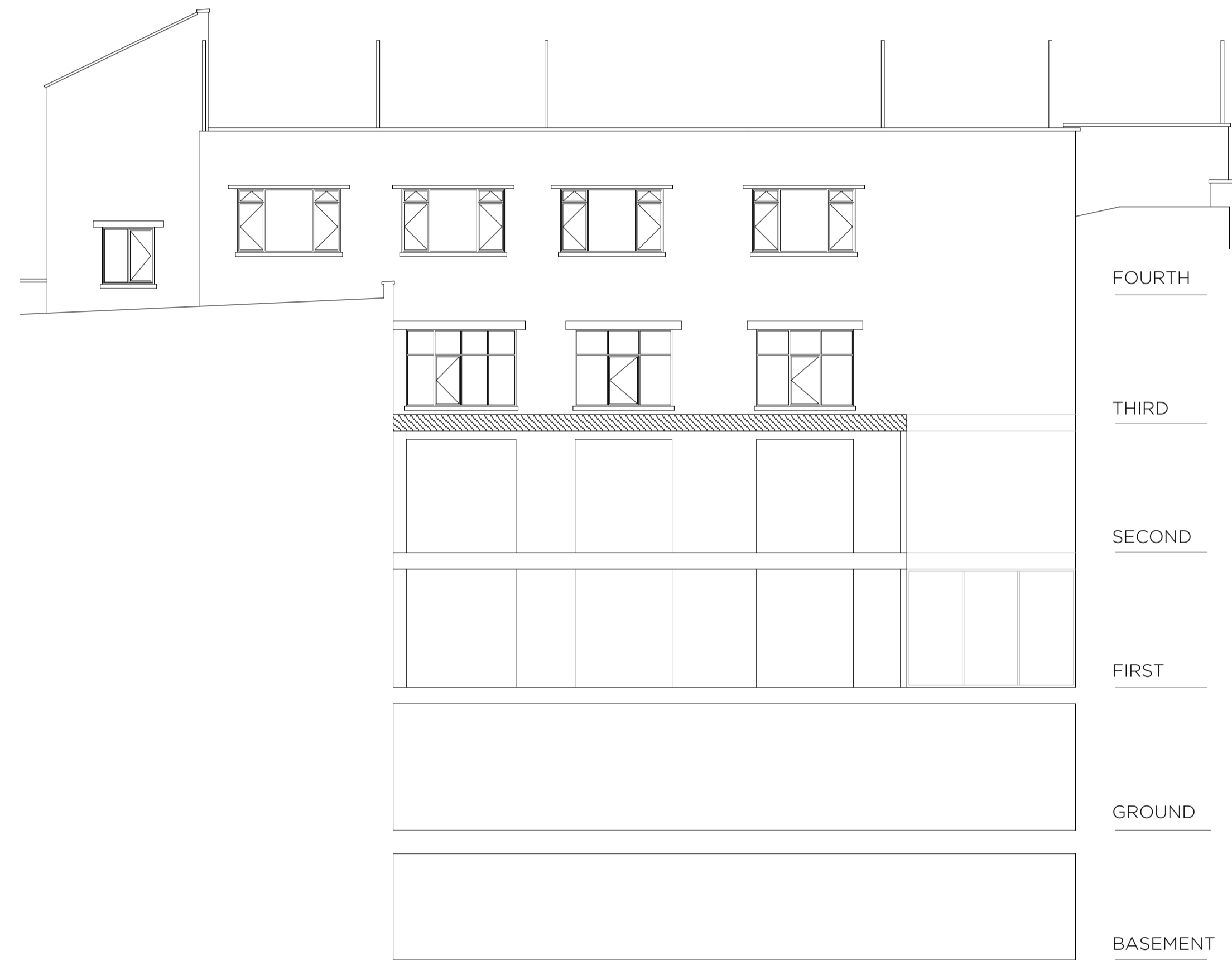
LIGHT WELL ELEVATION _ 4