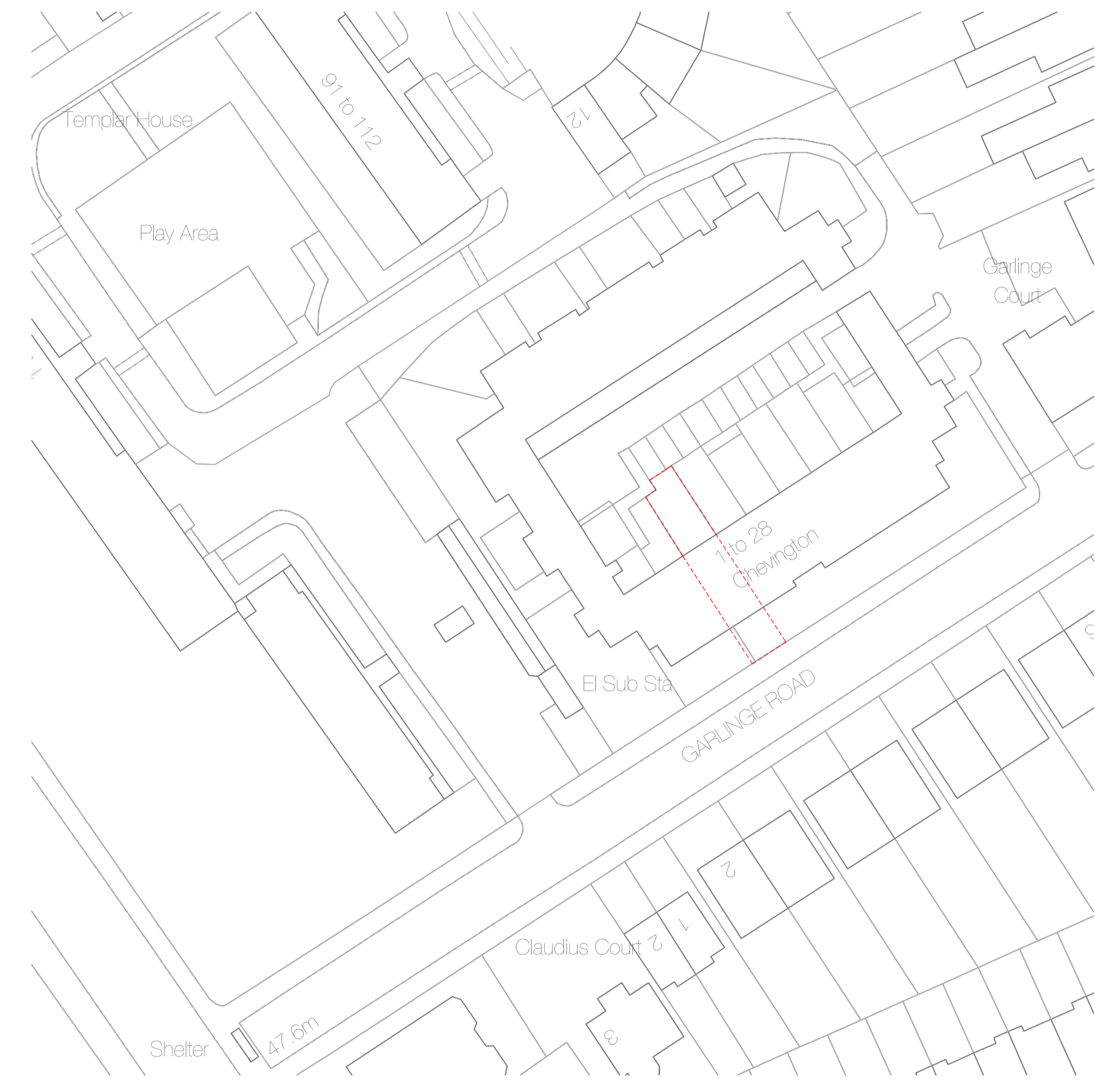
01 BLOCK PLAN SCALE 1:500

DO NOT SCALE FROM THIS DRAWING The contractor shall check and verify all dimensions on site and report any discrepancies in writing to the architect before proceeding with work. FOR ELECTRONIC DATA USE Electronic data/drawings are issued as "read only" and should not be interrogated for measurement. All dimensions and levels should be read only from those values stated in text, on the drawing. AREA MEASUREMENT The areas are approximate and can only be verified by a detailed dimensional survey of the completed building. Any decisions to be made on the basis of these predictions whether as to project viability, pricing, lease agreements or the like should include due allowance for the increases and decreases inherent in the design development and building processes. Figures relate to the key areas of the building at the current state of the design and using Gross External Area (GEA), Gross Internal Area (GI) and Net Internal Area (NIA) method of measurement from the Code of Measuring Practice, 5th edition (RICS code of practice). All areas are subject to Town Planning and Conservation Area Consent, and detailed Rights to Light analysis.