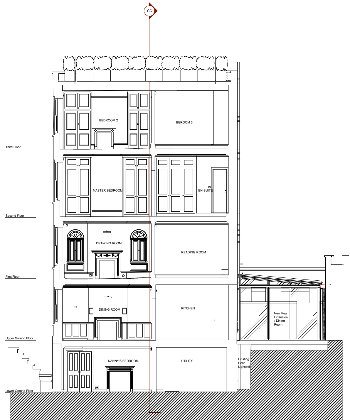
1 PROPOSED SECTION AA 1:50 @A1