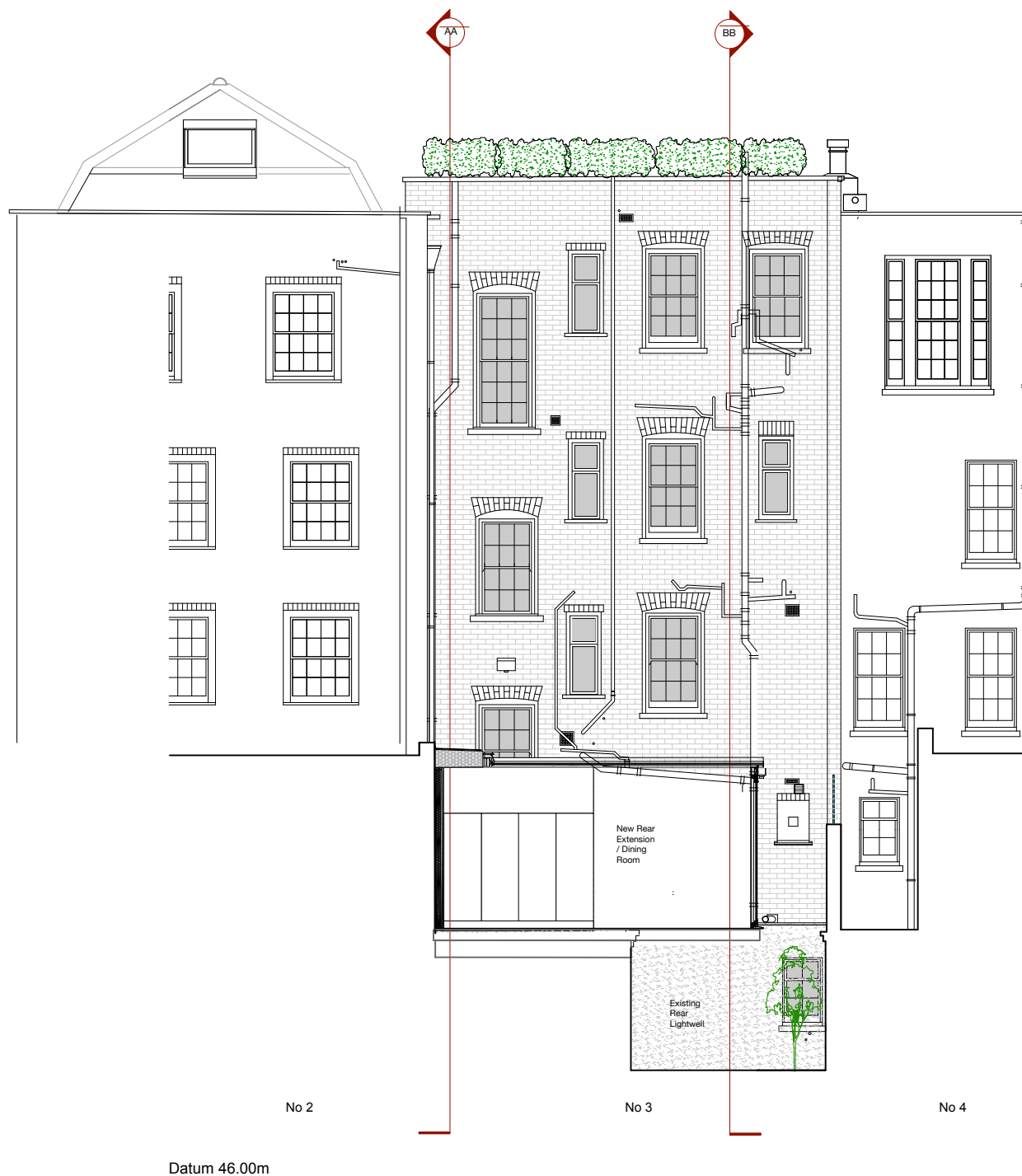
2 PROPOSED NORTH / REAR ELEVATION 1:50 @A1