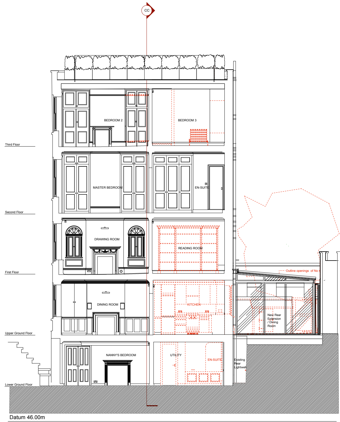
2 DEMOLITION SECTION BB 1:50 @A1