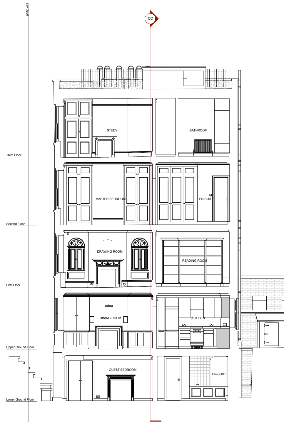
1 EXISTING SECTION AA 1:50 @A1