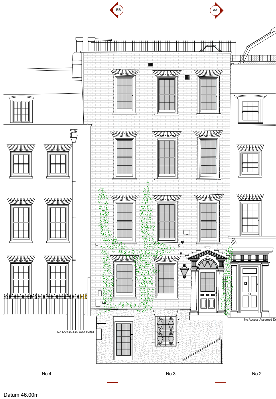
1 EXISTING SOUTH ELEVATION 1:50 @A1