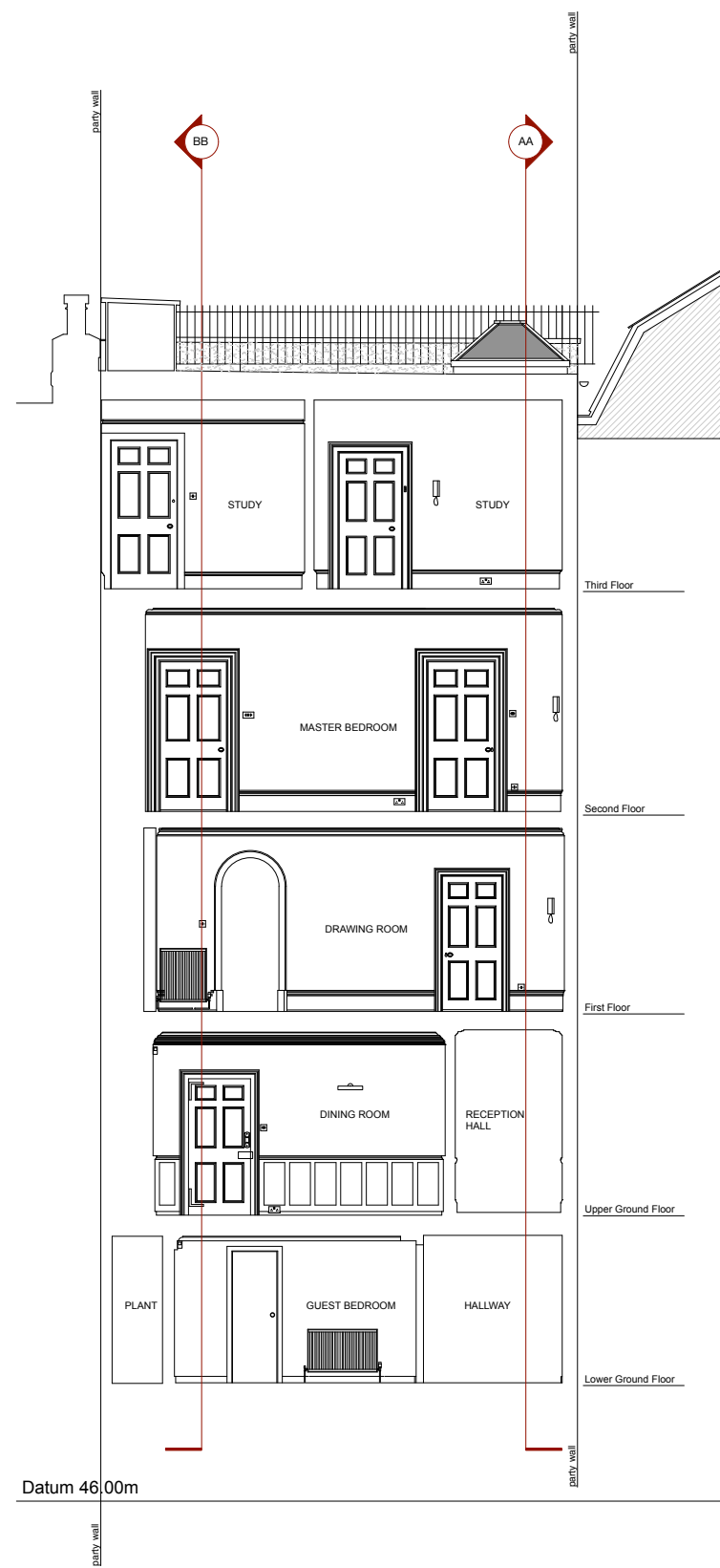
1 EXISTING SECTION CC 1:50 @A1