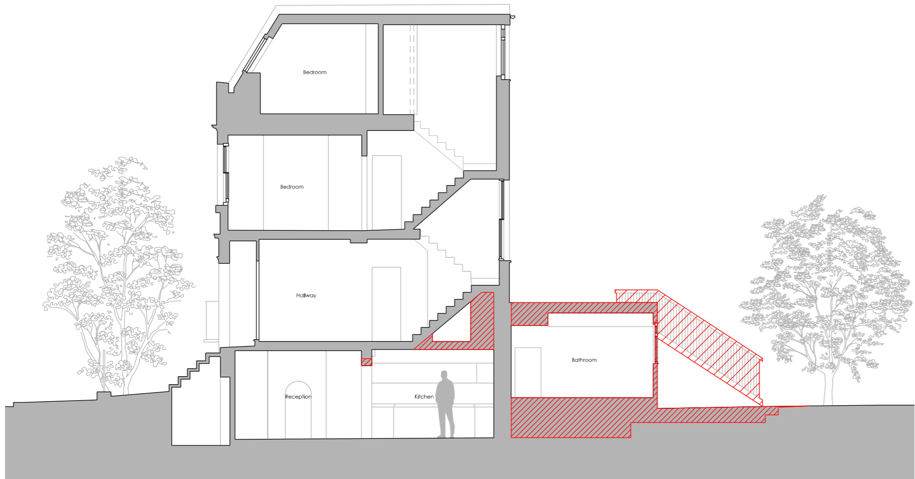
Existing Section AA