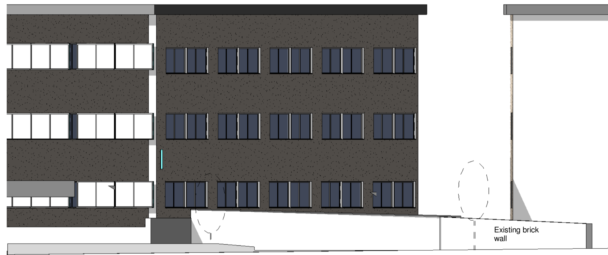
Existing South Elevation 1 : 100