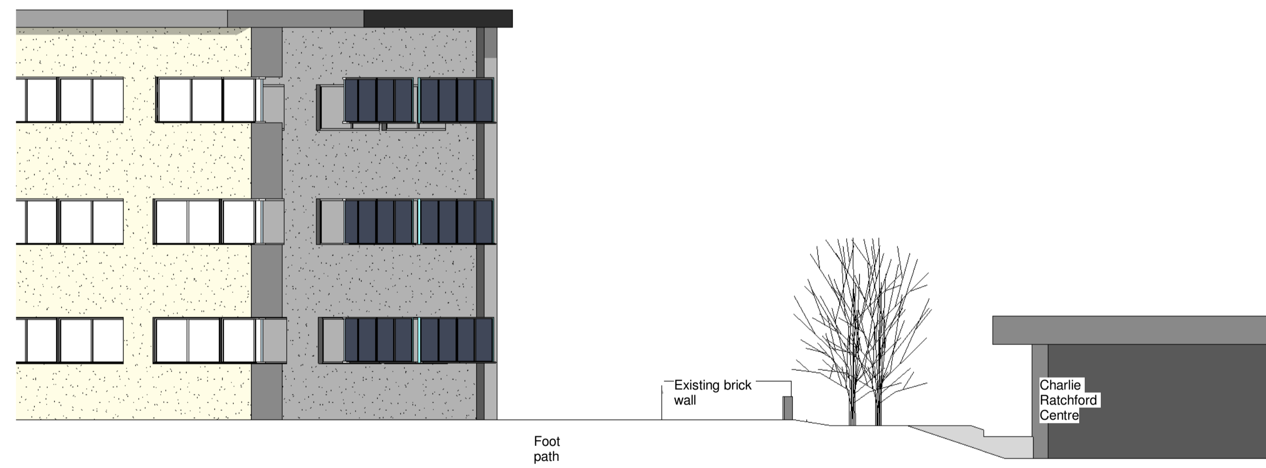
Existing West Elevation 1 : 100