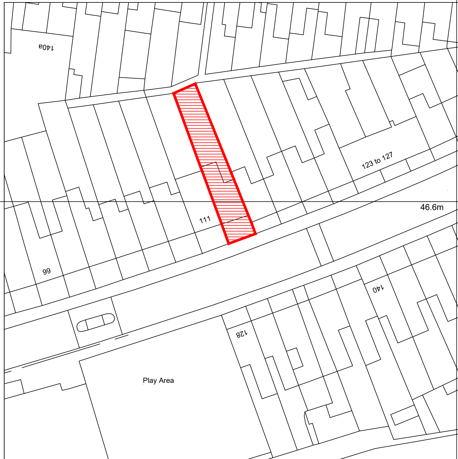
SITE PLAN Scale: 1:500